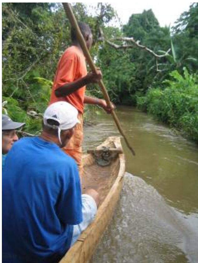
In 2007 IDMC have continued to undertake fact-finding missions to countries affected by internal displacement.

The Quarterly Update should be read along with the 2007 Annual Appeal , which outlines the main objectives, activities and financial needs for the year.