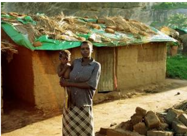
A displaced woman in Soroti, Uganda.