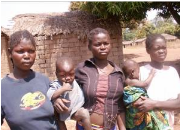
Displaced women and children in the Central African Republic, where the humanitarian situation continues to worsen.

A web page for the life stories project is being developed, which will link to the current IDMC page, but which can also be accessed independently. The aim of this website is to give a voice to internally displaced people so that they can tell their life stories in their own words. While the stories and voices will provide valuable insight when read in isolation, they may also act as a valuable tool to balance official discourse and traditional discussions of conflict and its consequences. The web page will be launched in Summer 2007.