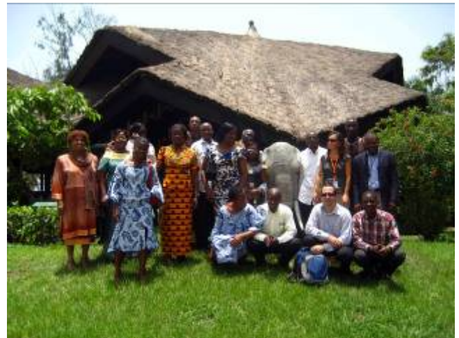
The trained trainers after attending an IDMC TOT event in Côte d'Ivoire, March 2007.

The workshop included a series of sessions led by an external consultant on the principles and practices of adult learning and teaching. During the second half of the workshop, the participants were all asked to facilitate sessions based on IDMC modules and facilitator's guides, which were translated into French. At the end of their session, the IDMC training team gave participants detailed feedback on to the training techniques used, and their time management and facilitation approaches.