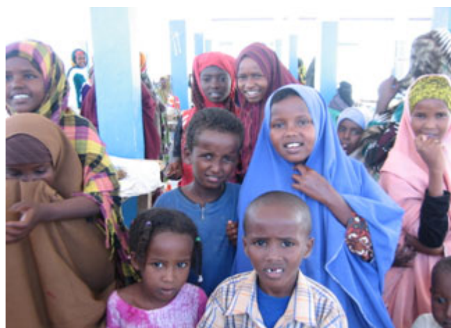
Children at a recently opened market place in an IDP settlement in Bossaso, Somalia

The Quarterly Update should be read along with the 2006 Annual Appeal, which outlines the main objectives, activities and financial needs for the year.