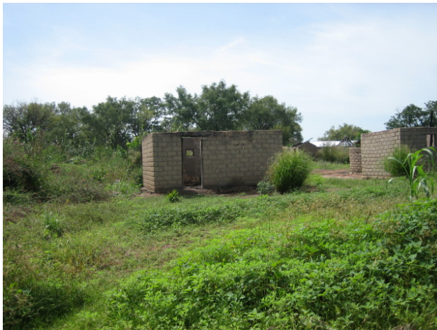
Burned and abandoned village in Bébouara, Foaïleng, October 2006

The IDMC, together with NRC Oslo, visited the northwestern prefectures of Ouham and Ouham Pendé in the Central African Republic from 21 to 28 October 2006 to collect first-hand information on the situation of internally displaced people, identify protection concerns and formulate recommendations. Insecurity is prevailing in the northern prefectures due to highway banditry, rebel activities and abuses by security forces including the Central African Armed Forces, the Presidential Guard and armed groups from Chad. An in-depth report on the IDP situation in the Central African Republic is expected to be published in early 2007.