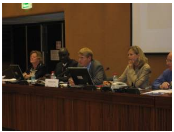
IDP Session at UNHCR Annual Consultations, chaired by IDMC.

NGOs preceding the yearly meeting of UNHCR's Executive Committee. The IDP session this year focused on the implementation of the cluster approach in situations of internal displacement, using Uganda as an example.