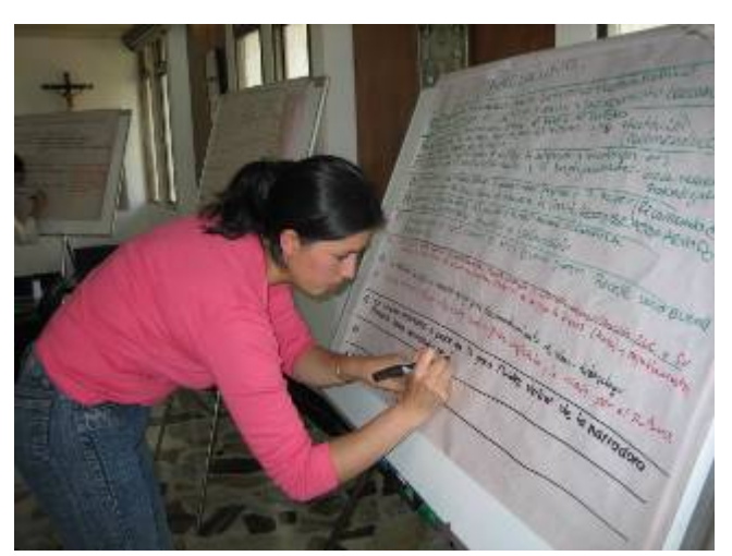
Participant in the Life Story Project, Colombia.

"It's a great effort to give voices to those who have been silenced and crushed as effects of the armed conflict, and it's extremely positive to create motivated groups to work on this."