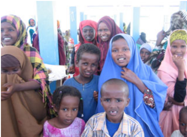
Children at a recently opened market place in an IDP settlement in Bossaso, Somalia

The Quarterly Update should be read along with the 2006 Annual Appeal, which outlines the main objectives, activities and financial needs for the year.