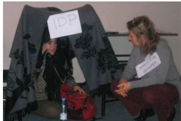
An example of forum play used in the Georgia workshop

from the training experience developed by the NRC team there, based a training technique based on theatre, called forum play. This technique, developed by the Brazilian theatre director and politician Augusto Boal in the 1980s, has proved to be an efficient tool for active learning as well as personal and community development and has helped to initiate social and political changes and legal reforms. Forum play has been used successfully by NRC Georgia to disseminate the Guiding Principles among displaced communities and mobilise them to defend their rights.