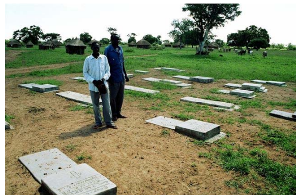
Cemetery in IDP camp in Lira District, Uganda. 18 people were killed here by LRA rebels in one night in 2003.

Dr. Koesparmono Irsan (National Human Rights Commissioner, Subcommission of Special Group Protection)