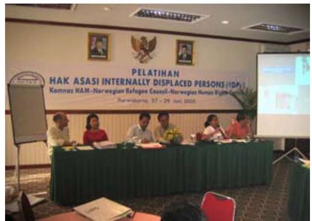
Workshop for the National Human Rights Commission of Indonesia, June 2005: Panelists representing state institutions, UN organisations and civil society inform participants about their mandate, capacity and experience in addressing the needs of IDPs in Indonesia.

The training department continued its capacity-building project for national human rights institutions in the Asia-Pacific region, by organising and delivering a training on the Guiding Principles to the National Human Rights Commission