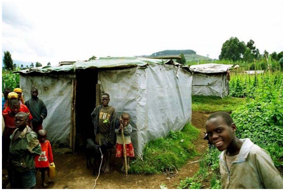
Appalling conditions in Gisenyi settlement sites established by the Rwandan government.

Based on data provided by the Global IDP Project und UNHCR, Maplecroft released an interactive web-based map on internal displacement. The map is designed as an innovative awareness-raising and management tool for business. In particular, it examines the role of business and the manner in which proactive companies are engaging through partnerships to support the protection and enhancement of displaced people's rights. The map can be viewed at http://maps.maplecroft.com