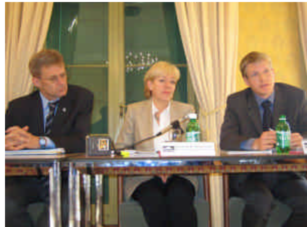
Launch of the Global Overview at the Geneva Press Club on 18 March 2005

On 16 March, the Secretary General of the NRC, Raymond Johansen, and the head of the Global IDP Project participated in a workshop meeting with Resident/Humanitarian Coordinators (HCs/RCs), organised by the Internal Displacement Division. The objective was to explore with the HC/RCs what can be done and what is needed to improve the implementation of the revised IASC IDP policy.