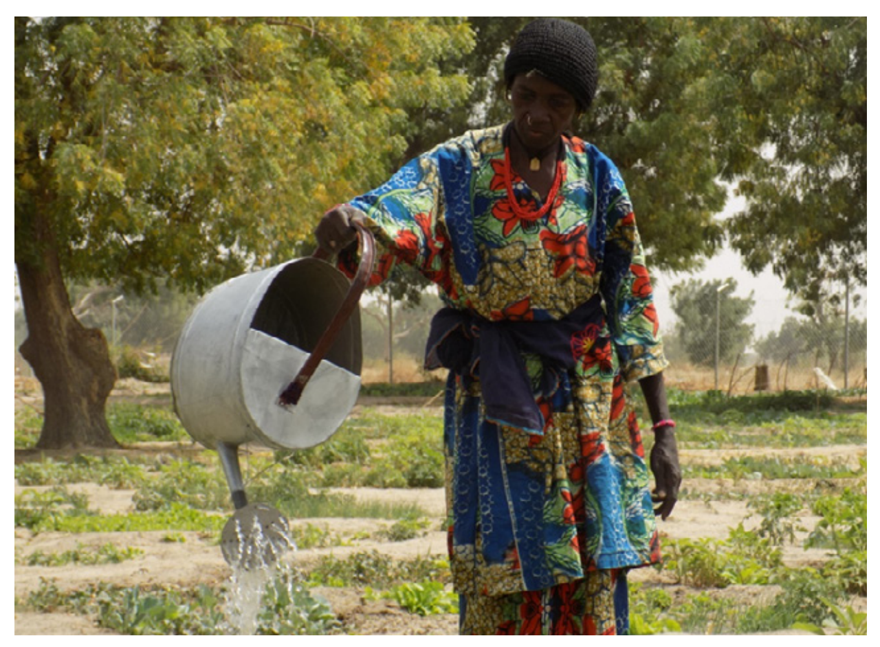
A woman using watering can to nurture her vegetables in Maiduguri.

Many coastal communities are traditionally dependent on fisheries for subsistence and income. The livelihoods