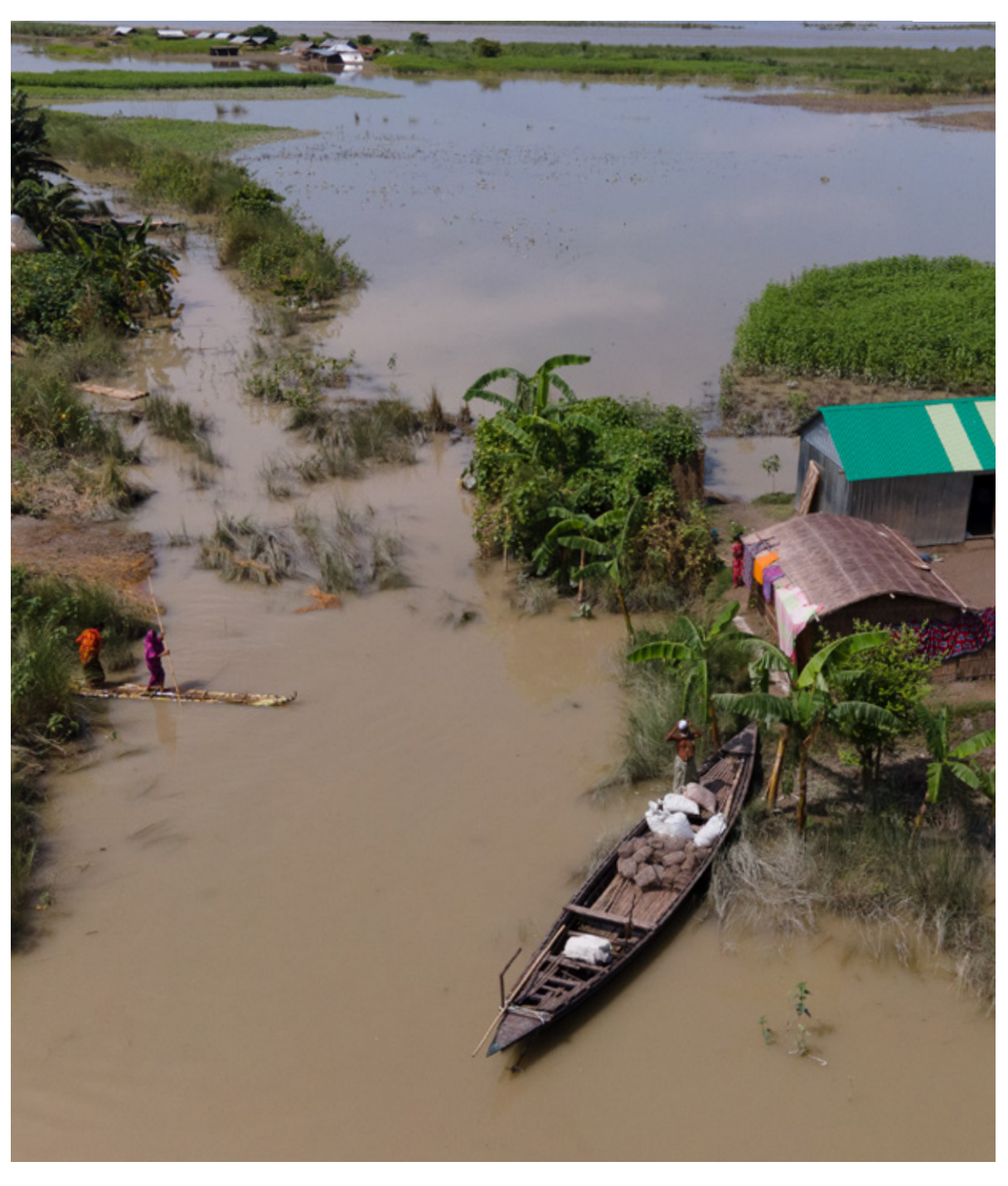
The heavy monsoon rains flooded the northern and north-eastern districts of Bangladesh. Earlier, during the last week of June 2020.

data and further analysis of the linkages between climate change's effects, other drivers and triggers of displacement, and the way climate displacement affects people's lives, is needed. So is more quantitative and qualitative data from displacement situations that remain almost entirely invisible in research today, such as displacement linked with sea level rise, coastal erosion, temperature rise and other slow-onset disasters.