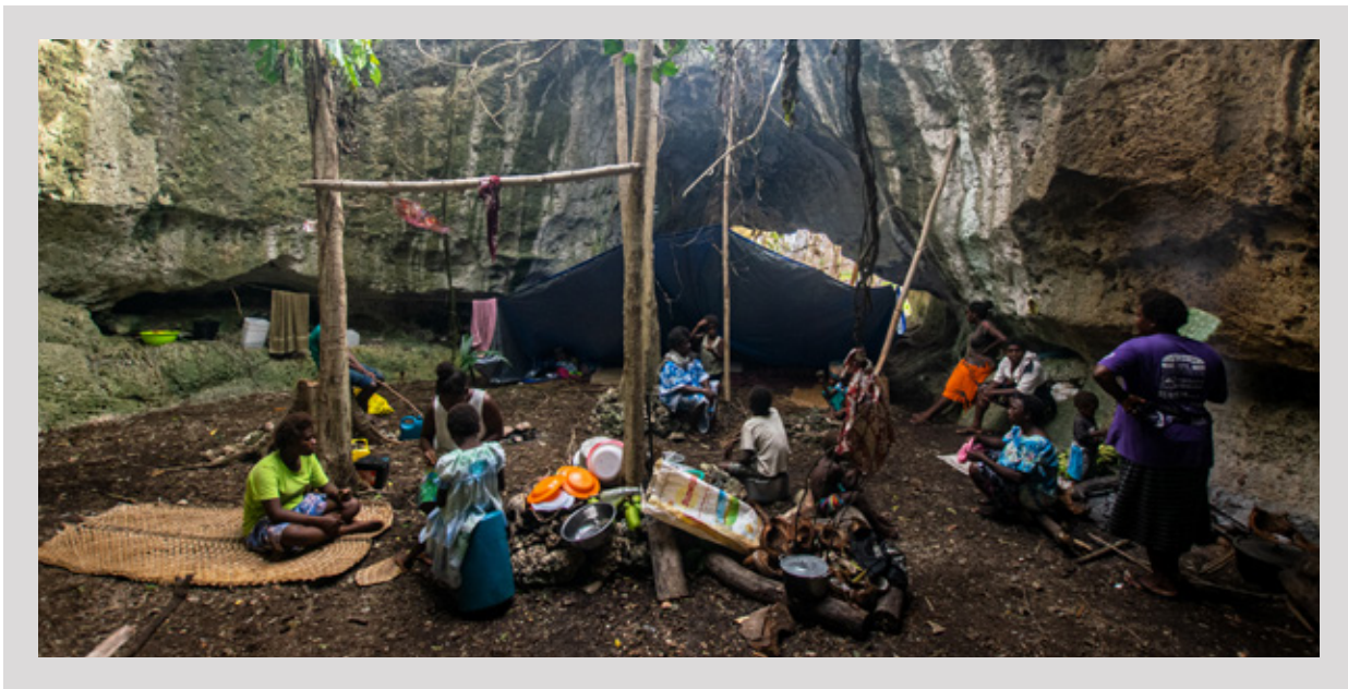
Inside the cave where 8 families took shelter during the cyclone and are still living there while they are in the process of rebuilding their homes that were damaged by the cyclone. April 2020, © UNICEF/UNI324747/Shing