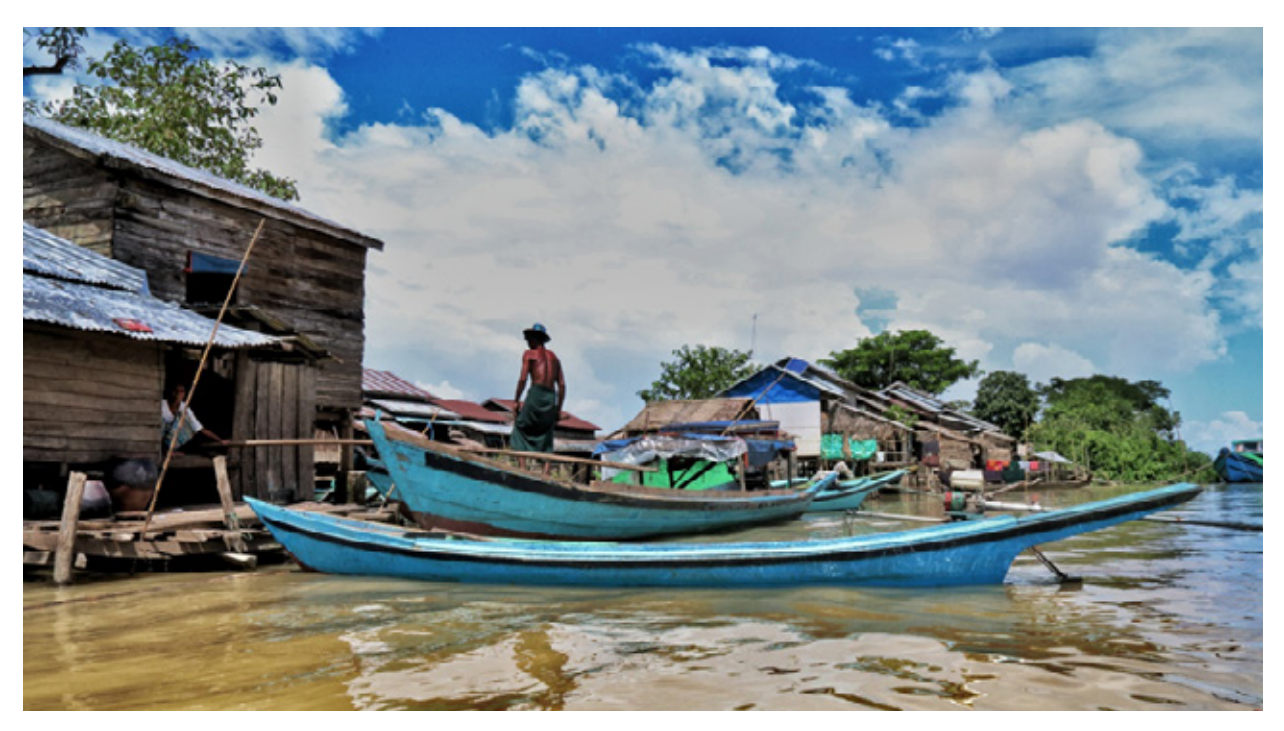
Flooding in Irrawaddy Delta, Myanmar. Photo: NRC, 2016

The most affected regions are South and East Asia, the Middle East and the circum Sahara region, extending from Algeria, Libya and Egypt to Mali, Niger, Chad, Somalia and Sudan.<sup>25</sup> The American continent is also exposed to desertification.<sup>26</sup>