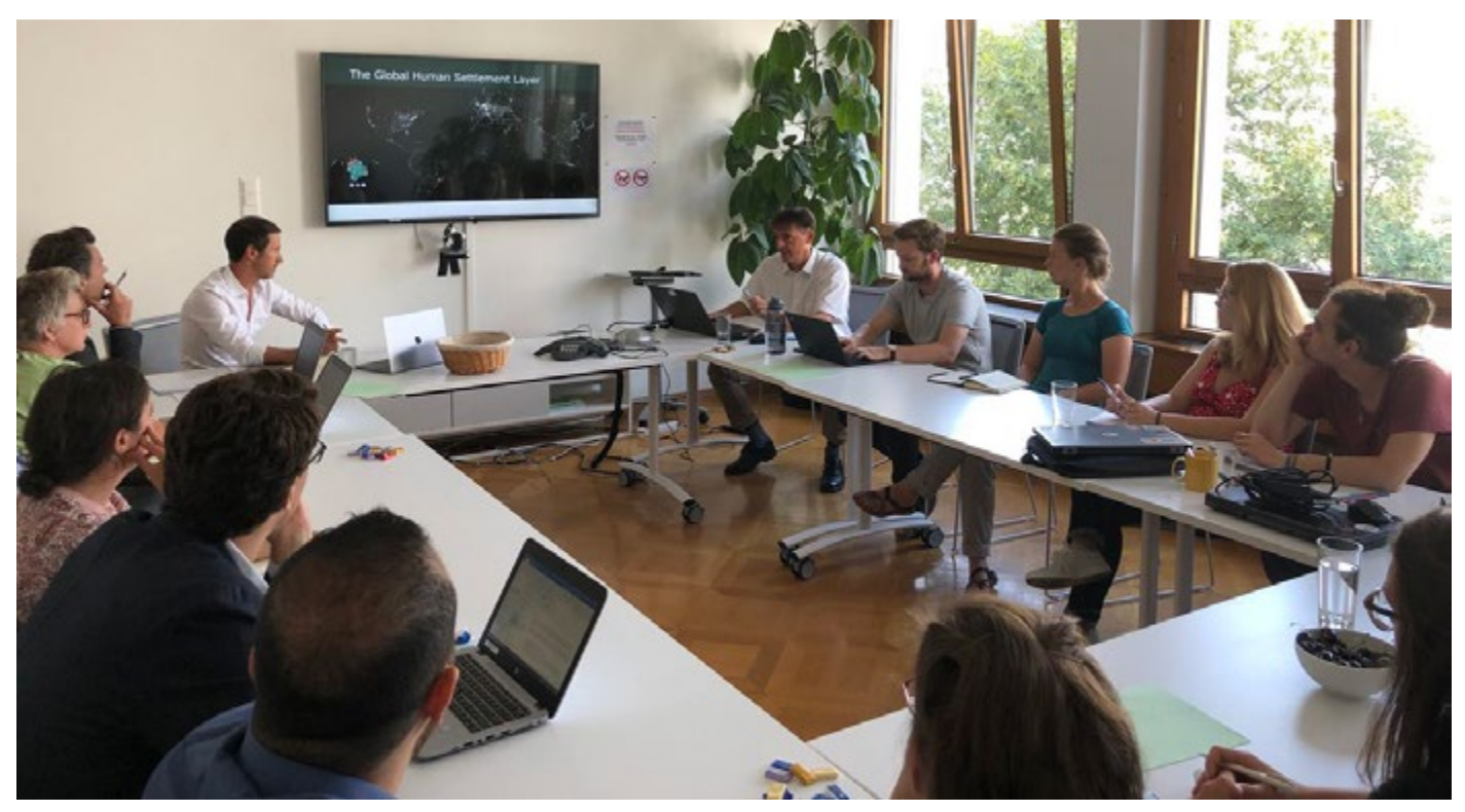
IDMC hosts the ECJRC's presentation of the new Global Human Settlement Layer. Photo: IDMC, July 2018