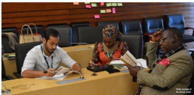
Participants prepare for group work at a Kampala Convention training event in Addis Ababa. Photo: African Union, December 2014