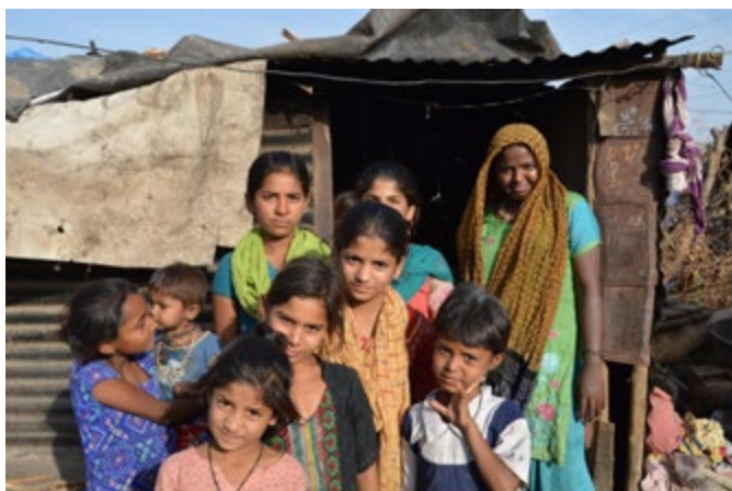
IDPs in Ganeshnagar interim site displaced by the Sabarmati Riverfront Development Project, Ahmedabad, Gujarat

IDMC will be publishing a report on the key findings of this research mission in the second quarter of 2016. The main findings relating to adequate housing were shared with the UN Special Rapporteur on the right to adequate housing ahead of her visit to India in April 2016.