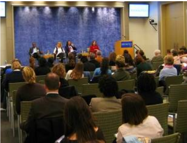
Presentation of the Colombia IDP voices project at Brookings Institution, Washington.

As part of efforts to enhance the rights of IDPs, IDMC carried out in March an advocacy mission to high-level decision makers in Washington and New York in close collaboration with the Washington Office on Latin America (WOLA). After meeting IDMC and WOLA in Washington, the US Congress started to reconsider its support to oil palm plantations as a means to mitigate forced displacement and eradicate coca growing in Colombia.