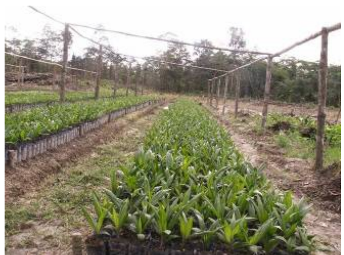
Palm oil plantations in Cauca, southern Colombia.

In March, preliminary findings indicating that palm oil plantations aggravate the internal displacement situation in Colombia were presented to US Congress, Library of Congress, USAID and US State Department officials, researchers and international institutions and NGOs in Washington and New York.