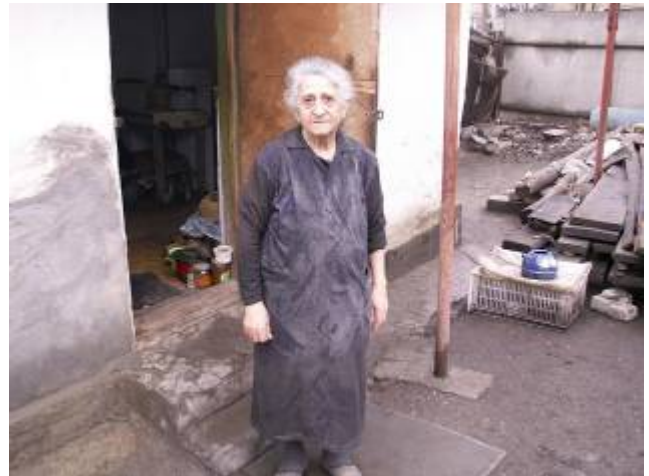
Pyatigorsk, Russia: an elderly IDP woman from Chechnya.

With the information collected, IDMC made a submission to the UN Committee on the Elimination of Racial Discrimination and will publish an in-depth report at the end of May. The report will be sent to European institutions (European Union, Council of Europe and OSCE), UN agencies (UNHCR, UNDP, UNICEF, OHCHR), other international organisations (World Bank, ICRC, Danish Refugee Council), the Government of the Russian Federation, international human rights organisations, Russian human rights NGOs and the media.