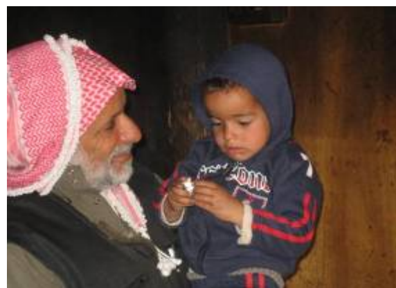
Palestinian Israeli Bedouin with his grandchild in an unrecognised Bedouin village in Negev.

IDMC conducted a fact-finding mission to Occupied Palestinian Territory (OPT), Syria (Golan Heights), Israel and Jordan in late February and early March. IDMC visited over 16 urban and rural localities to gather information for country updates and further develop advocacy activities.