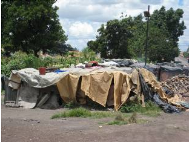
30 families, evicted from their homes in 2005, living in makeshift shelters in Mbare, Harare.

sion, IDMC briefed the IASC in Geneva, and had meetings with OHCHR, OCHA (DPSS and GMCS), UNHCR (PCWG, DIPS, IDP Support Section, Africa Bureau, and the Statelessness Unit), and with the RSG's staff at UNHCR. The meetings focused on IDP protection, and the challenges faced by the Protection Working Group in Zimbabwe.