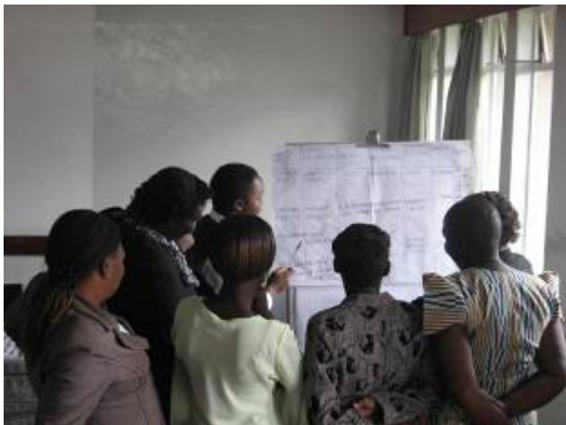
Training session in Nakuru, Togo.

The staff and commissioners of the Togolese HRC gained new knowledge about the UN Guiding Principles, the situation of the displaced in Togo and the national and international response mechanisms in particular. The THRC undertook to incorporate IDPs into their work plan and formulated recommendations to the Government to develop a legal framework, organise a national forum, put in place a data collection mechanism and national response mechanism.