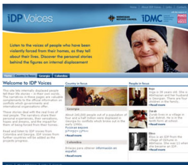
The IDP Voices project website, at www.idpvoices.org

A book on thirteen of these stories was as well developed in the three languages. The book will be launched in Tbilisi, Georgia on 30 April together with NRC Georgia. An audiovisual presentation was developed for the event, based on several life stories.