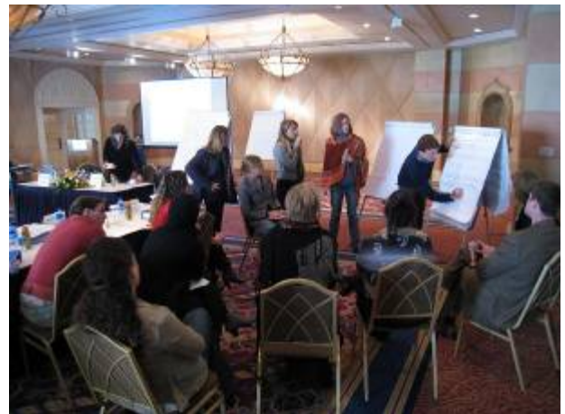
Training session in Bethlehem, OPT.

As this workshop addressed displacement in the West Bank, it was agreed that a training workshop should also be conducted for the relevant organisations in the Gaza strip. Furthermore, the UN agency for the Palestinian Refugees (UNRWA) is considering to strengthen its role in protection issues and has approached the IDMC to plan a workshop for its staff.