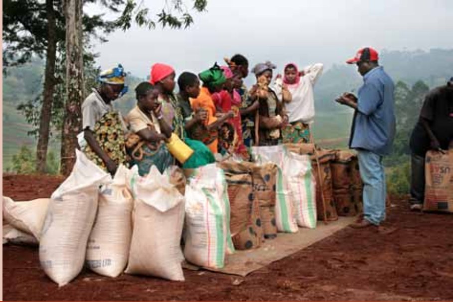
Food distribution to a group of IDPs in South Kivu, in the Democratic Republic of Congo

“ Everyone displaced by conflict or natural disaster is an individual. A person, likely a woman or child, who may be undernourished and living in fear of recruitment or rape. A person whose potential remains unrealized, with dreams unfulfilled and contributions forgone. ”