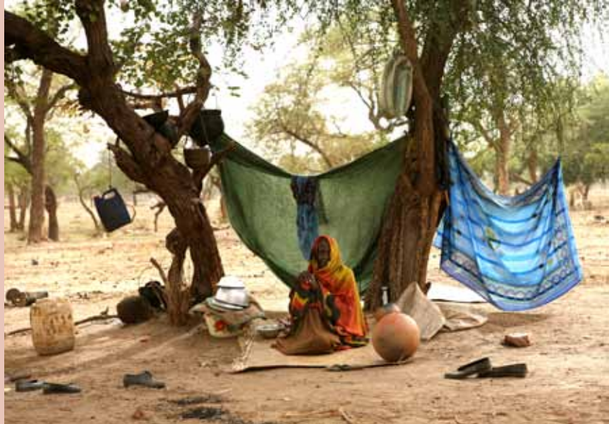
Chadians fleeing attacks on their villages pitch a makeshift camp on the outskirts of Goz Beida

“ The causes of displacement – in Africa, as in other parts of the world – are of course manifold and complex. Quite apart from natural disasters or development-induced displacement, in most cases the root causes of displacement are those that have triggered, or at least contributed to, armed conflict or situations of violence in the first place. ”