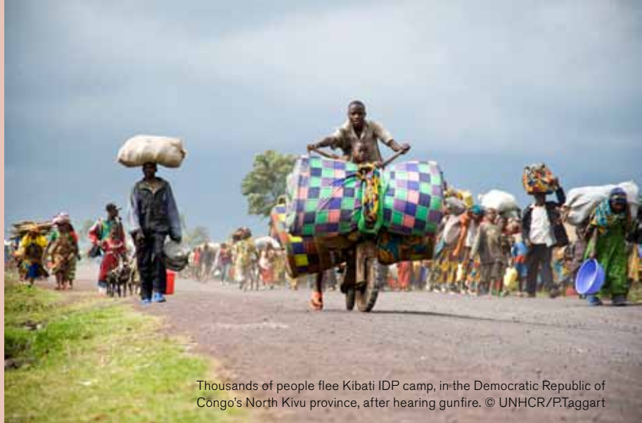
Thousands of people flee Kibati IDP camp, in the Democratic Republic of Congo's North Kivu province, after hearing gunfire.

“ The Convention represents an important achievement, but not an end in itself. Everything is in fact just starting as this is an indispensable tool that will serve a regional vision aiming at improving the life of the populations and turning this continent in one where life is good, sheltered from fear and needs. ”