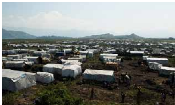
Some people have been living in camps like this one in Bulengo, in North Kivu in the DRC, for years

The end of displacement is not always easy either. IDPs attempting to rebuild their lives by going home, integrating