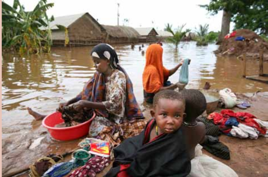
In 2006, floods displaced thousands of people in southern Somalia

“ Displacement is a devastating experience. Those who flee or are forced to leave their homes may find security but they have to pay a heavy price. They leave behind their property, livelihoods, community ties and all they cherished. Dreams are shattered and hopes gone, and often it takes years or even decades for them to rebuild normal lives. ”