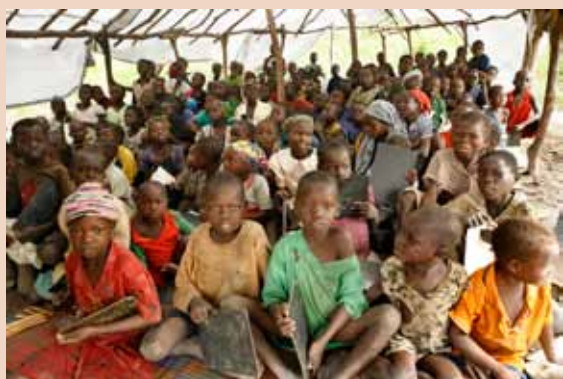
Children displaced by an attack on their village attend class at a bush school in the Central African Republic

In May 2010, thousands of people displaced from their homes in the Central African Republic (CAR) could not be reached by aid workers because of insecurity caused by the Ugandan Lord's Resistance Army (LRA) and other armed militias. At least 20,000 people have fled their homes in the northern and southeastern regions since January 2010, bringing the total number of IDPs in the country to more than 160,000. Despite joint anti-LRA operations by the governments of Sudan, Uganda and DRC, the LRA has continued to brutalise and abduct civilians. In early 2010, the CAR government deployed another 250 troops to protect the displaced populations and humanitarian convoys.