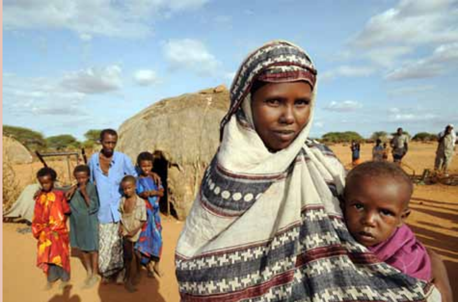
The Mohamed family at Belet Amin IDP settlement, Somalia

“ The Convention is a major achievement. It represents the will and determination of African States and peoples to address and resolve the problem of internal displacement in Africa. ”