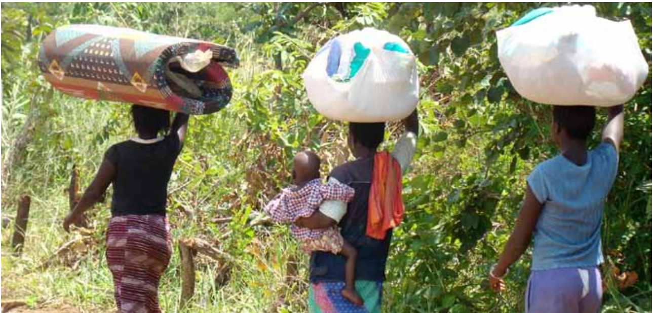
IDPs moving back to their villages in northern Uganda

assistance to IDPs. In order to meet that obligation, they have to develop appropriate laws, policies and strategies.