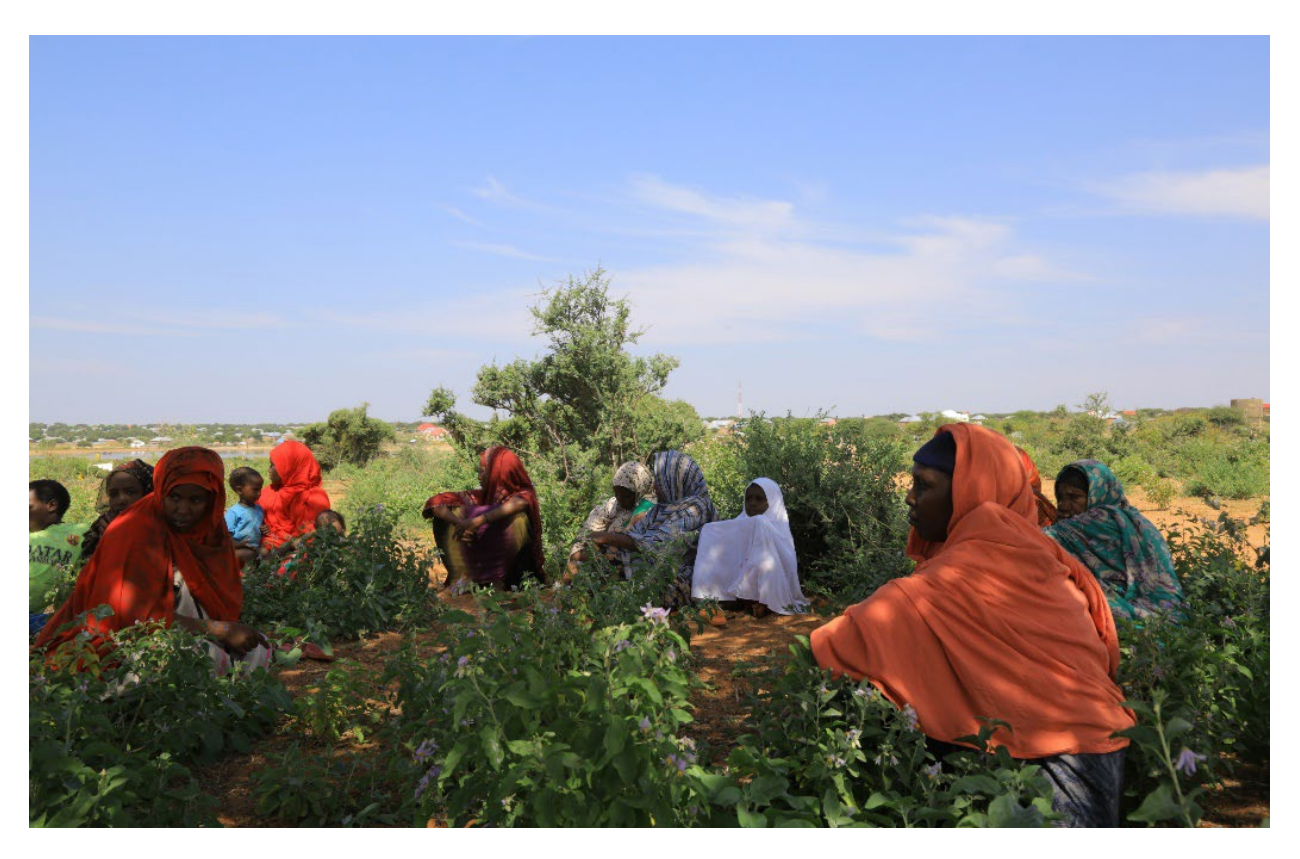
Displaced women have discussed the possibility of creating cooperatives, Gaafaw kebele (Warder woreda), IDMC/2020.

stock marketing and farming. The regional government, UN agencies and NGOs have supported some restocking activities as well as efforts involving start-up capital. Participants say they are committed to creating small-scale business cooperatives.