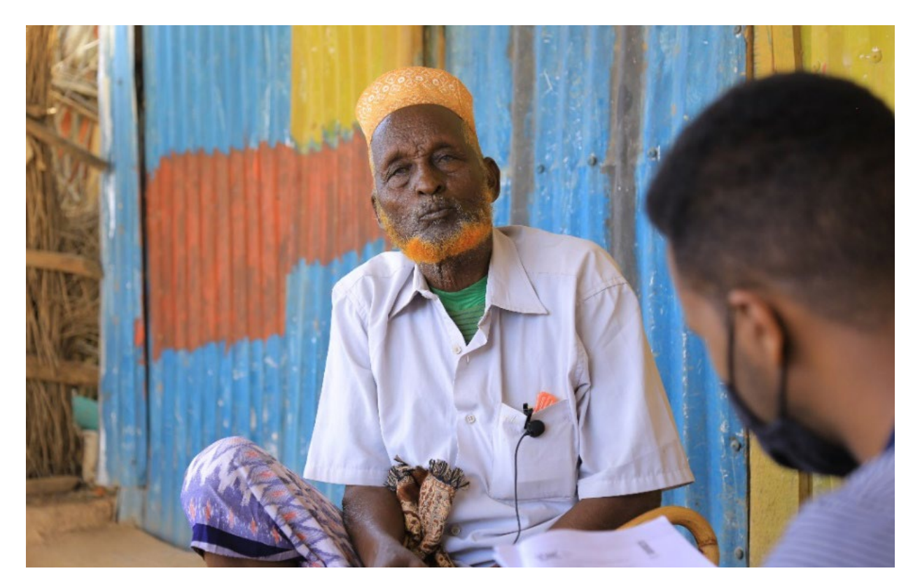
Interview with a local IDP elder in Buundada kebele (Kebridehar woreda), IDMC/2020.

The participatory methodologies employed in this study were used in some of the same locations as the research conducted in 2019. As a result, they serve to reinforce some of the information from that study, while offering reflections on solutions to displacement from the same participants. During the 2019 study, IDPs and their host communities expressed weariness with the number of assessments to which they had been subjected. It was for this reason that this research focused on more qualitative methodological techniques where all participants could express themselves more openly and offer more detailed observations. All names in the report have been changed.