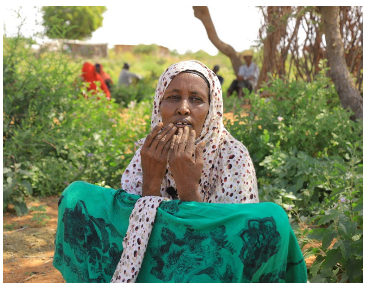
Acceptance and integration are easy because IDPs and host communities belong to the same clans. Gaafaw kebele (Warder woreda), IDMC/2020.