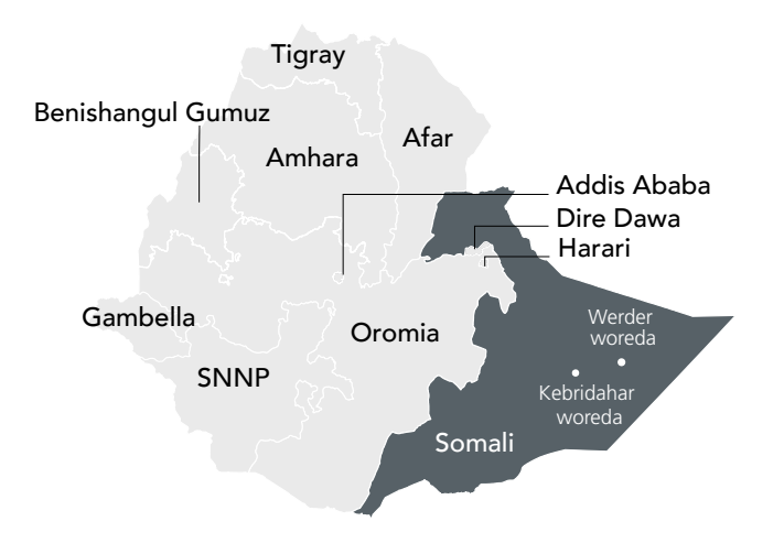
MAP 1: Research locations and participants

The research for this report was conducted using semi-structured qualitative interviews and focus group discussions on Warder and Kebridehar woredas. Fifty-one interviews and three focus groups were carried out in Gaafaw and Roob da'ay kebeles (Warder woreda in the Dollo zone) and Banburad and Buundada kebeles (Kebridehar woreda in the Korahe zone). The overall aim of the exercise was to gather information on the experiences and views of families who had left their homes and those who had remained in their areas of origin, as well as local and regional authorities, UN agencies and NGOs.