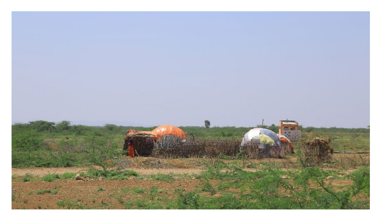
Proposis juliflora, locally known as Garanwaa, in Buundada kebele (Kebridehar woreda), IDMC/2020.

"Most people in this area are struggling, as there is no particular source of income. Some families have a few cattle, some have a small flock of goats, and others have nothing at all and wait for the government. Still others are dependent on the national Productive Safety Net Programme (a cash and food transfer programme)."