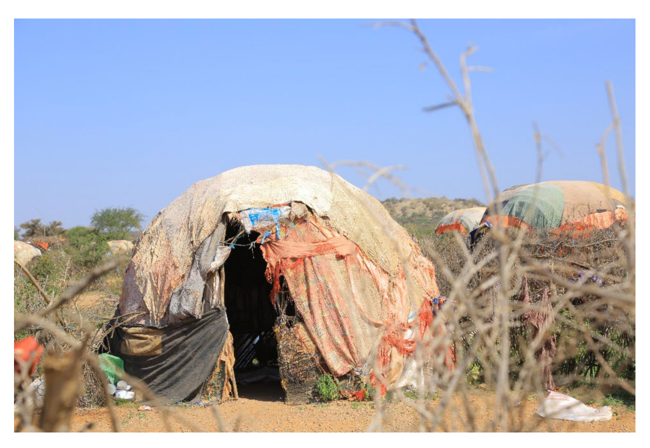
Shelters have not improved since the humanitarian emergency following the drought of 2017. Communities consider this a priority. Banburad kebele (Kebridehar woreda)