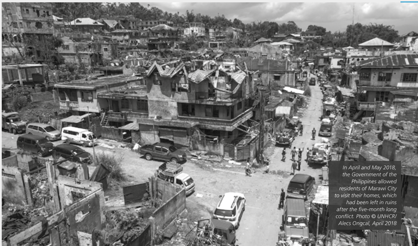
In April and May 2018, the Government of the Philippines allowed residents of Marawi City to visit their homes, which had been left in ruins after the five-month long conflict. Photo © UNHCR/ Aleks Ongcal, April 2018

in to retrieve what they could from the rubble of their homes before the area was cordoned off. It remains uninhabitable, and reconstruction will not begin until the debris has been cleared and roads rebuilt, which is expected to take at least 18 months. 149