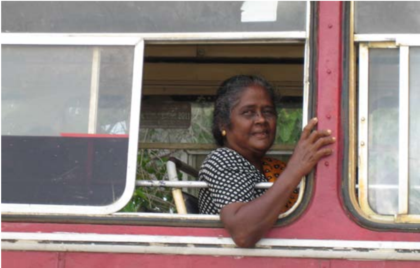
Woman internally displaced since 1990. Her land in Jaffna district was released from military occupation in March 2015. Photo: IDMC/Anne-Kathrin Glatz, April 2015

measures for monitoring implementation, but more research is needed to determine its impact. 36 We estimate that at least 44,000 people were still living in internal displacement in Sri Lanka as of the end of 2016, and many of those previously deregistered as IDPs may still be struggling to reach durable solutions. 37