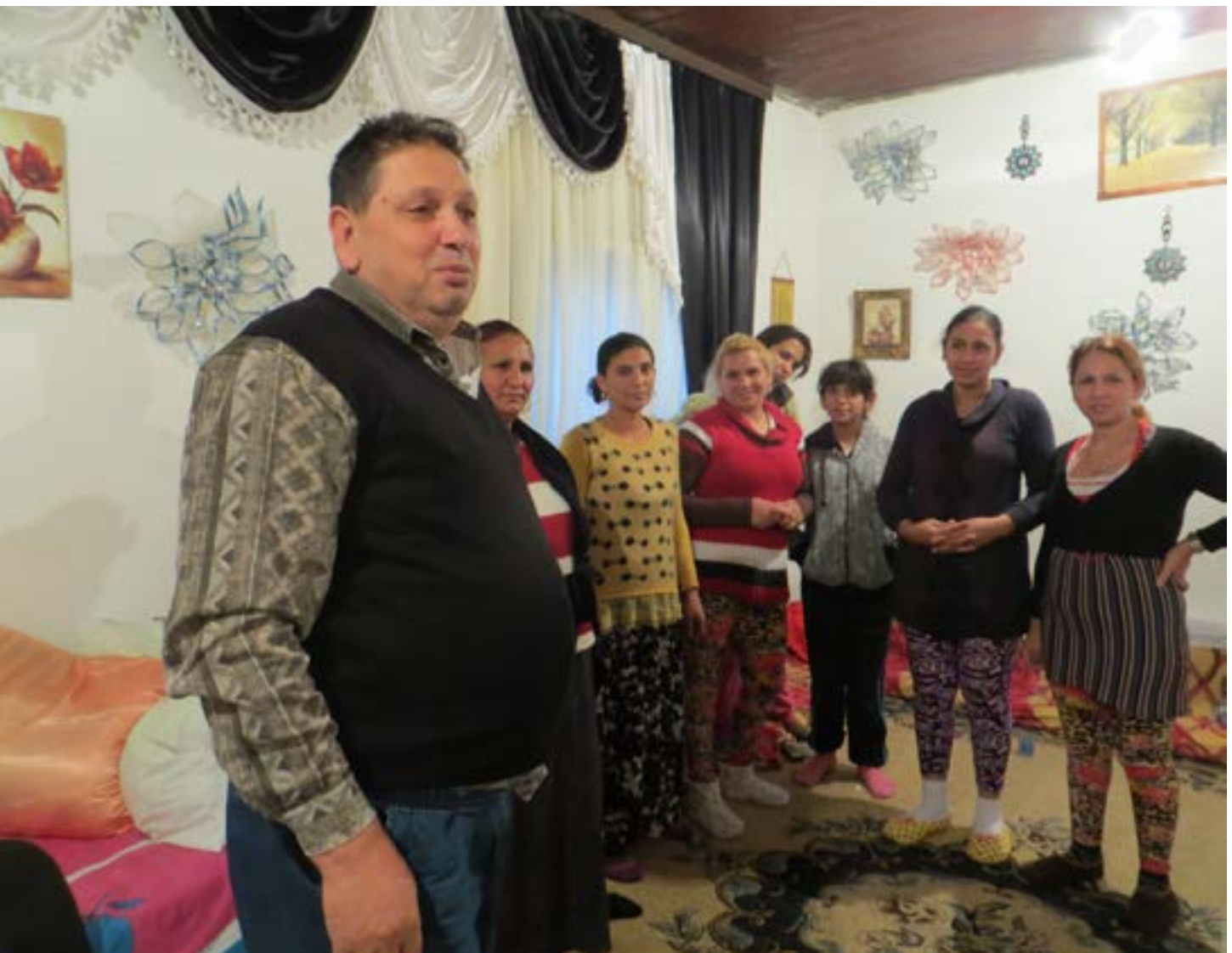
Returnees from a Roma neighbourhood in the northern city of Mitrovica, Kosovo. They were satisfied with their living conditions upon return, but the lack of employment opportunities led some residents to leave. Photo: IDMC/Nadine Walicki, December 2014

Conflict erupted in Kosovo in 1998 between armed elements of the territory's majority Albanian population and the predominantly Serbian forces of the former Yugoslavia, which had historically controlled the region. The conflict led to the displacement of over one million Kosovo Albanians; then, following NATO airstrikes and