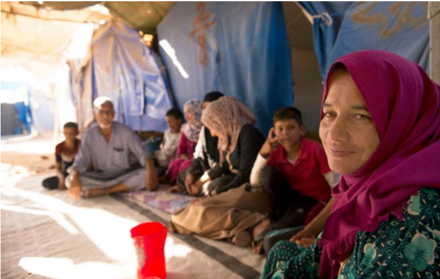
Members of a family of 18 members sit in front of their tents in the Kilo 18 displacement camp. They have been confined to the camp for the last 10 months. Barred from leaving, an uncle was a member of ISIS and so they are not allowed to return home.

rights concerns affecting the lives of IDPs, particularly when IDPs do not perceive that the state is protecting their rights.” 76