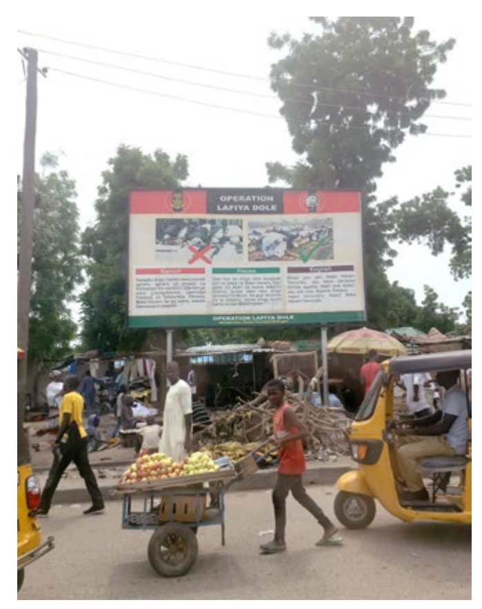
Counter-terrorism messaging in Monday Market.

has forced both civilians and militants to flee within and across Nigeria's borders. The Civilian Joint Task Force, made up of as many as 45,000 vigilante fighters, has also gained traction in recent years.<sup>19</sup>