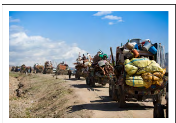
After a year in displacement, these IDPs are leaving New Durrani camp to return to their areas of origin in the central part of Kurram agency, FATA.

Military operations against non-state armed groups (NSAGs) have forced hundreds of thousands of people to flee North Waziristan and Khyber agencies since May 2014. Both agencies are part of the Federally Administered Tribal Areas (FATA) in the northwest of the country, a region that has suffered fighting and displacement for a number of years. By the end of 2014, up to 907,000 people had been newly displaced, and as of July