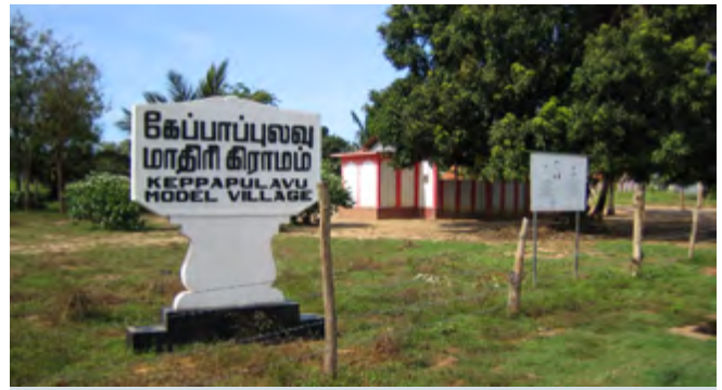
Road entering Keppapilavu relocation village, Mullaitivu district. © IDMC/Anne-Kathrin Glatz, April 2015

Underdevelopment and lack of action to restore livelihood opportunities in the north and east mean that IDPs struggle to make ends meet. Many IDPs who have lost access to all or