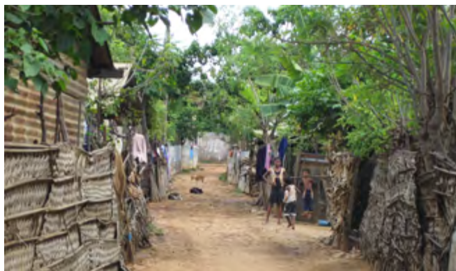
Internally displaced children in a camp in Jaffna district. © IDMC/ Anne-Kathrin Glatz, April 2015