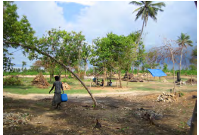
IDPs returning after 25 years in displacement are clearing their land in Jaffna district. © IDMC/Anne-Kathrin Glatz, April 2015

The new government has taken a different approach. In June 2015 the NGO secretariat, which previously came under the Ministry of Defence, was moved under the Ministry of Policy Planning. 19 The Ministry of Resettlement and the Resettlement Authority have begun to develop a return plan for areas recently released from military occupation as well as a durable solutions strategy. Facing a budget crisis 20 , the government needs the support of international organisations and donors in order to implement the plan.