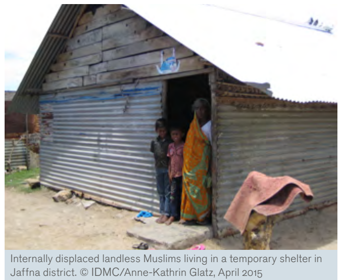
Internally displaced landless Muslims living in a temporary shelter in Jaffna district. © IDMC/Anne-Kathrin Glatz, April 2015

During their protracted displacement, IDPs have married and children have been born. For those who lost most or all of their assets when they first became displaced, providing their daughters with housing and land according to local dowry custom has been extremely challenging, if not impossible. Sri Lankan dowry custom, common to all three communities – Tamil, Muslim and Sinhala – provides for land to be passed as dowry from parents to their newly married daughters. Displacement has disrupted the functioning of this system as it has led to loss of assets and interrupted the process of building up assets for dowry, contributing to landlessness. 24