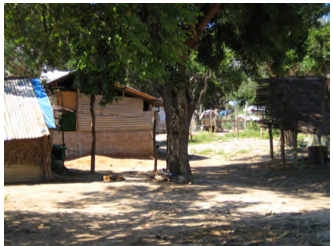
IDPs' makeshift shelters near Mullikulam in Mannar district, their home village which remains occupied by the Sri Lanka Navy. © IDMC/Anne-Kathrin Glatz, April 2015

Sri Lanka's experience of internal displacement illustrates how long-term displacement is often a development challenge that needs to be addressed first and foremost by governments and also by supporting development actors 5 . Effective collaboration between humanitarian and development actors from the beginning of a humanitarian crisis, together with political will to facilitate durable solutions, are key to tackling