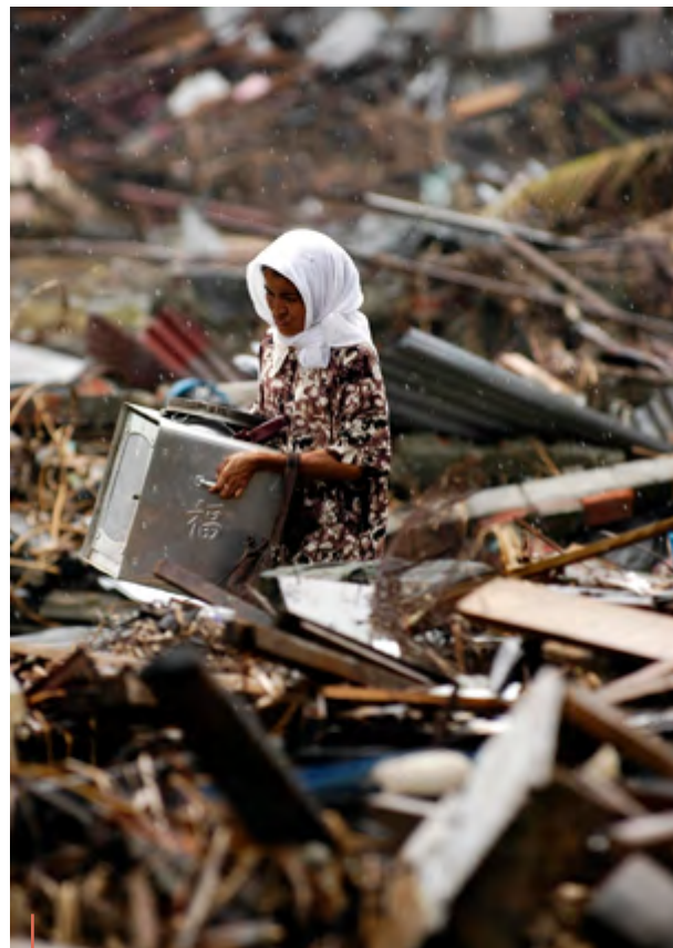
An Indonesian woman searches through debris in the rain, where her house once stood, in the city of Banda Aceh on the island of Sumatra, Indonesia. Photo credit: US Navy/Jordon R. Beesley, January 2005

The case study illustrates the need to facilitate durable solutions for displaced informal settlers that take social cohesion and access to livelihoods into account. It shows that cash grants are in this case used as a short time