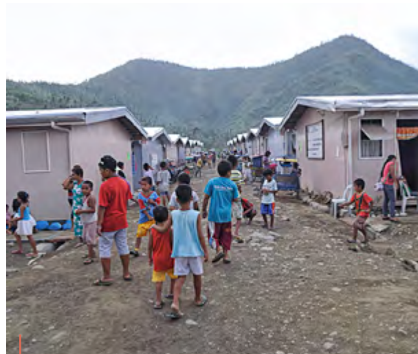
Life inside the International Pharmaceuticals Inc. bunkhouse community in Tacloban, one of the biggest cities affected by Haiyan. © IOM/Alan Motus, April 2014. https://flic.kr/p/n8snfX

The government initially recommended the establishment of a blanket no-build zone stretching 40 metres