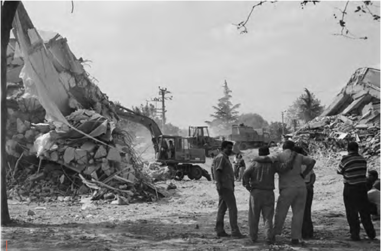
The devastation of the 1999 Turkey earthquake.

ected by the earthquakes, initially focused on ensuring that property owners would benefit from the government’s programme, and later supported the tenants and urban informal settlers sidelined by it. Two years after the earthquakes, when the municipality began demolishing tenants’ and informal settlers’ prefabricated houses and tents without offering them alternative housing, the association questioned government policies that only considered the owners of damaged and destroyed property as “victims”.