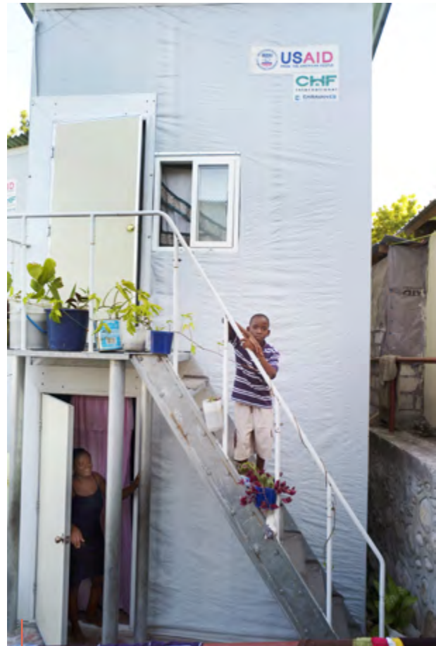
Residents in new housing in Ravine Pintade, a hilly area in the center of Port-au-Prince which was previously damaged by the earthquake. An extra floor was added to address the small size of the plots. Photo: CHF/Maggie Steber, May 2012

The Nansen principles build on the Human Rights Council 2009 report, which explores the link between disasters and human rights. As mentioned above, the report examines the impact of climate change and disaster-induced displacement on the enjoyment of specific rights and on vulnerable groups, and ways in which it contributes to forced displacement and conflict. 61