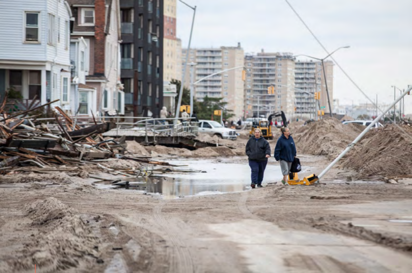
Residents survey the scene on Long Island, New York following Hurricane Sandy.

The displacement disasters cause increases their vulnerability to human rights violations still further. They may face discrimination on the basis of their tenure status, in that they may be ineligible for reconstruction assistance if they do not own their land or home, and they may be exposed to forced eviction and unjustified or inadequate relocation if their settlement is declared unsuitable for reconstruction. Urban IDPs forced to flee again by a disaster face similar challenges, often made worse by their illegal presence in a settlement and their lack of documents proving residence.