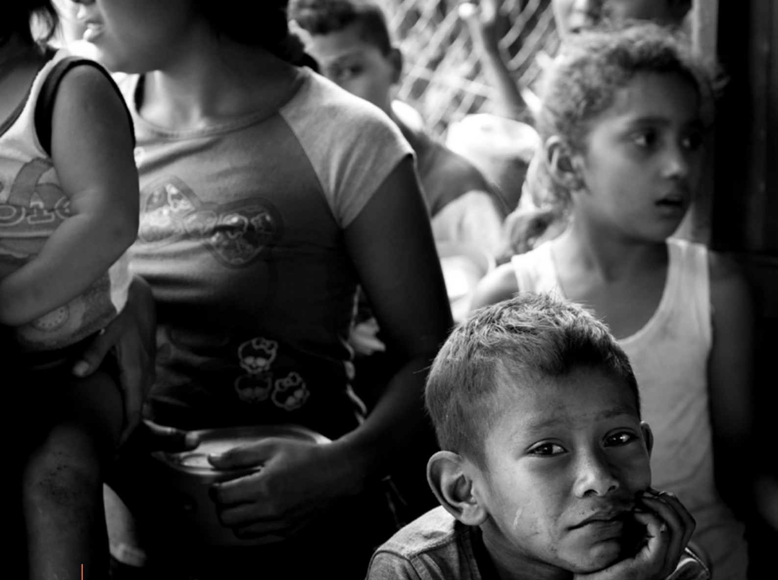
Displaced villagers from Hurricane Mitch now living in the Chinnidaga Dump.

ment partners, international organisations showed little interest in the barrio project and preferred to develop their own programmes.