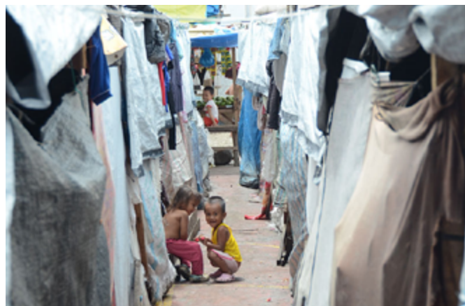
Displaced children play by one of the many corners of the Joaquin Enríquez Memorial Stadium, Zamboanga's largest camp which hosted close to 2,500 families in June 2014. (IDMC, June 2014).

In late June, IDMC conducted a fact-finding mission in Zamboanga, in the southern Philippines, to assess the local displacement situation and needs of an estimated 64,000 people who remain displaced as a result of the September 2013 conflict between the government and a faction of the Moro National Liberation Front (MNLF). In July, IDMC published a blog calling on the government