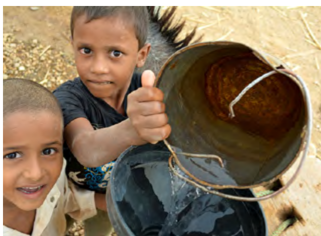
Internally displaced boys living in Al Madab settlement, Hajja, Yemen, fetch water from a well while using a donkey to transport the water to their home 100km away. Photo: NRC/Nashon Tado, June 2013

Intermittent armed conflict and violence have mainly taken place on three fronts in Yemen in recent years. The Shia al-Houthi movement has led a violent insurgency in the north, there has been civil unrest in central and southern regions, and government forces have clashed in the south with militants associated with the Southern Separatist Movement and Ansar al-Sharia, an offshoot of al-Qaida in the Arabian Peninsula (AQAP). The fighting has caused ongoing and often repeated internal displacement, which has taken place in the context of a growing socio-economic and humanitarian crisis. Political instability has left the government struggling to provide basic services, contributing to increased needs among vulnerable groups.