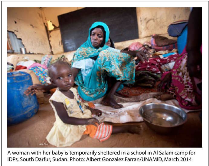
A woman with her baby is temporarily sheltered in a school in Al Salam camp for IDPs, South Darfur, Sudan.

As the third anniversary of South Sudan's independence approaches and as the three-year conflict in South Kordofan and Blue Nile continues, the situation in Sudan remains deeply worrying. There is on-going fighting between non-state armed groups and the government (including aerial bombardment), inter-communal violence and tensions over land and other resources. The number of internally displaced people (IDPs) rose in early 2014 due to an escalation of military campaigns in South Kordofan and inter-communal violence in the Darfur region. As of December 2013, there were an estimated 2,426,700 IDPs in government- and