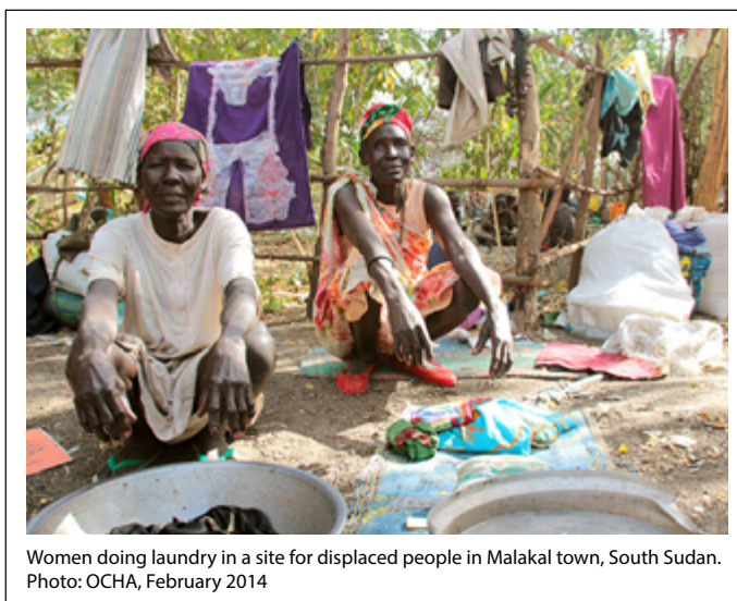
Women doing laundry in a site for displaced people in Malakal town, South Sudan. Photo: OCHA, February 2014

More than a million people, or around one in ten of the country's population, have been internally displaced and more than 390,000 have fled the country ( OCHA , June 2014). Attention and assistance has focused on the 95,000 internally displaced people (IDPs) sheltering in the UN peacekeeping mission's military bases ( UNMISS , June 2014), but 90 per cent of those fleeing their homes have taken refuge elsewhere, and have little access to protection, services or humanitarian aid.