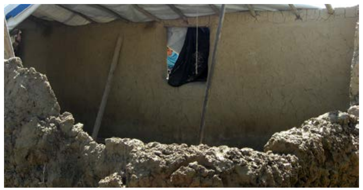
This housing in Nasaji Bagrami was reportedly damaged after heavy rains.

Roughly 60-70 per cent of urban areas in Afghanistan have developed informally.<sup>12</sup> The majority of informal settlements are located in or around the major cities