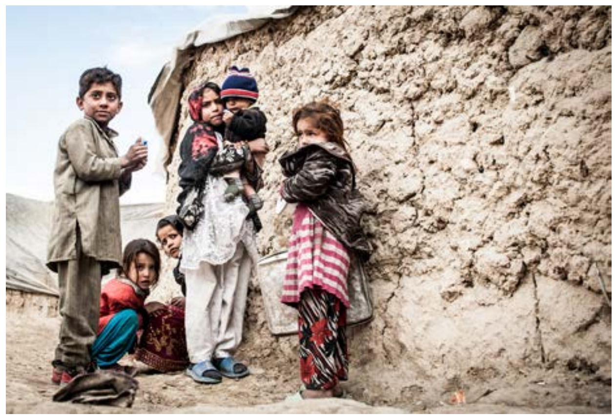
Internally displaced children in Kabul.

Although there have been limited positive changes, the state has insufficiently addressed issues around urban security of tenure. Appropriate legislation and land and housing policies are required to guarantee tenure security and urban development plans must take into account the needs and rights of the poorest and most vulnerable. Widespread land-grabbing for private gain by strongmen,