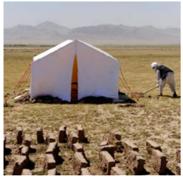
A displaced man puts up his tent in a Emergency Response camp in Herat province of Afghanistan.