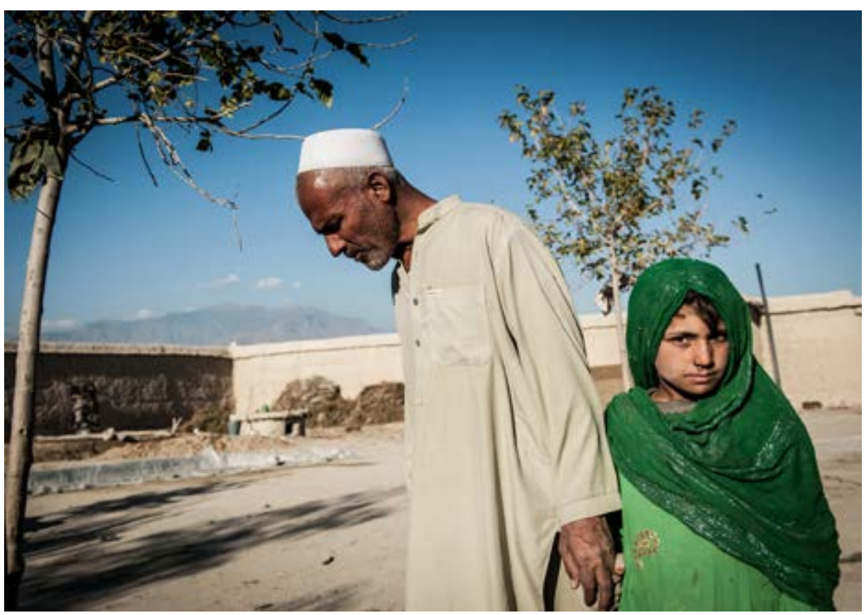
IDPs in Laghman province (NRC/Christian Jepsen, November 2013).

Afghanistan's 2004 Constitution guarantees a number of rights to housing, land and property relevant to the prohibition on forced evictions.<sup>42</sup> Under article 40(4), "nobody's property shall be confiscated without the provisions of law and the order of an authorized court." Article 38 further provides that, "no one, including the state, shall have the right to enter a personal residence [...] without the owner's permission or by order of an authoritative court, except in situations and methods delineated by law." 43 Article 14 requires that "the state shall adopt necessary measures for provision of housing and distribution of public estates to deserving citizens in accordance with the provisions of law and within financial possibilities."44 However, none of the evictions planned or carried out in the studied communities had been authorised by a court order.