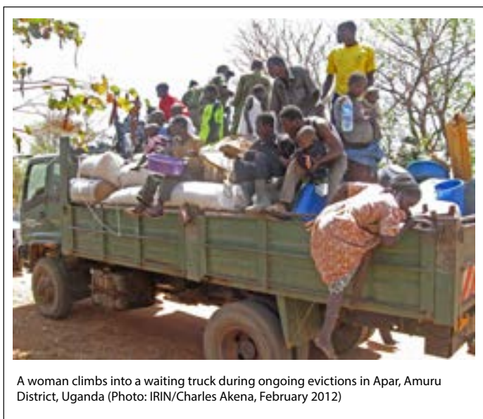
A woman climbs into a waiting truck during ongoing evictions in Apar, Amuru District, Uganda (Photo: IRIN/Charles Akena, February 2012)

Since the 2006 signing of a cease-fire agreement between the government of Uganda and the Lord's Resistance Army there has been significant return of those displaced by conflict in northern Uganda. The overwhelming majority of the 1.8 million internally displaced people (IDPs) who lived in camps at the height of the crisis have returned to their areas of origin, driven by their cultural ties to the land and the region, or resettled in new locations. Support for recovery and development in areas to which IDPs have returned has been insufficient. Returnees have faced continuing difficulties due to inadequate basic services and limited support to rebuild their livelihoods. The return process has been marred by land conflicts, sometimes leading to violence.