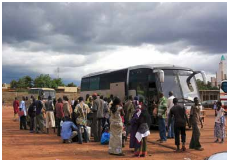
Malians who fled the unrest in the northeastern city of Gao wait at a bus station in Bamako to return to Gao, September 2012.

Few could have predicted that Mali, long considered a beacon of democracy in West Africa, would in less than a year see half its territory overrun by Islamic militants and a tenth of its northern population internally displaced. Instability and insecurity resulting from clashes between government forces and Tuareg separatists and proliferation of armed groups in northern Mali in the wake of a coup d'état have combined with a Sahel-wide food crisis to force some 393,000 Malians from their homes since January 2012, some 118,800 of whom are estimated to be internally displaced.