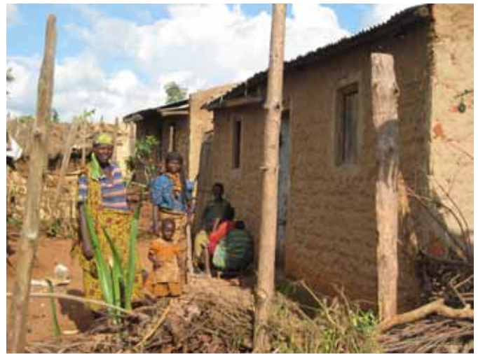
Inhabitants in Musenyi, an integrated village designed to bring durable solutions to repatriated refugees and some IDPs (IDMC, November, 2011).

international actors on required follow up