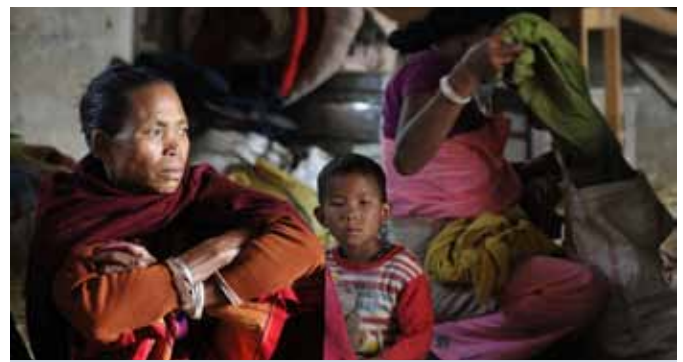
An internally displaced woman in a makeshift relief camp in Kukurkata in Goalpara district of Assam state near the Assam-Meghalaya border. (Ritu Raj Konwar, January 2011)

Also in November, IDMC/NRC submitted a stakeholder report on conflict- and violence-induced internal displacement in India to the Universal Periodic Review (UPR) of the UN Human Rights Council. The report covered displacement in Jammu and Kashmir, the north-east, central India, Gujarat, and Orissa, and focused on IDPs' rights to an adequate standard of living, to education, and to work.