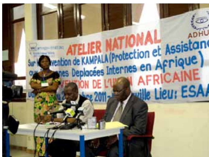
Representatives of the Association des Droits de l'Homme et l'Univers Carcéral and the Ministry of Justice making closing remarks for workshop participants and the media (IDMC, October 2011).

During a two-day workshop, IDMC presented and facilitated discussions on internal displacement in the Republic of Congo.