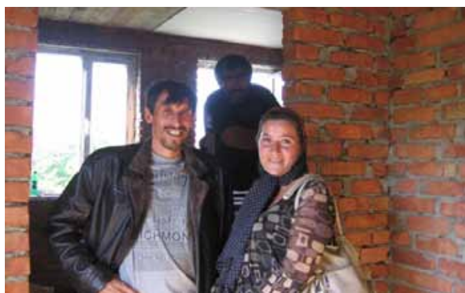
Returned IDPs in their newly built home. After years of living in harsh conditions in a temporary settlement, this family was looking forward to living in a new home on their previous land built with assistance from the Danish Refugee Council.

At the request of the Council of Europe's Committee on Migration, Refugees and Population, IDMC prepared a briefing note highlighting the main displacement-related challenges continuing to face IDPs in the North Caucasus. IDMC presented the main messages in this briefing note at a hearing on internal displacement in the Russian Federation, during a meeting of the Committee in Paris in September. The aim was to inform the visit of a Committee delegation to the Russian Federation. Following the delegation's visit, IDMC was invited to contribute to the drafting of the Rapporteur's report, which should be published in 2012.