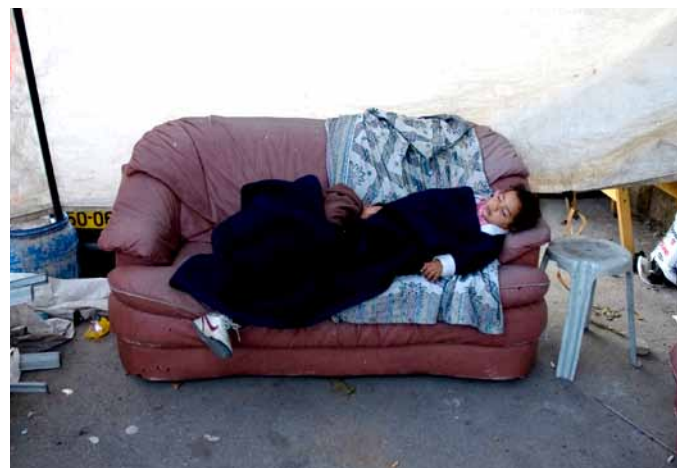
Internally displaced children sleep on their couch in Sheikh Jarrah, East Jerusalem. (Activestills/Anne Paq, February 2010)

There are over 160,000 IDPs in Israel and Palestine and the exhibition highlighted the three phases they underwent; communities at risk of displacement, the initial stage of displacement, and the conditions once displaced. The exhibition raised the awareness of the Israeli public on the situation of displacement in their country and the territories which Israel occupies. These events were part of IDMC's continued advocacy in Israel and Palestine, and across the Middle East, to promote a better understanding of internal displacement.