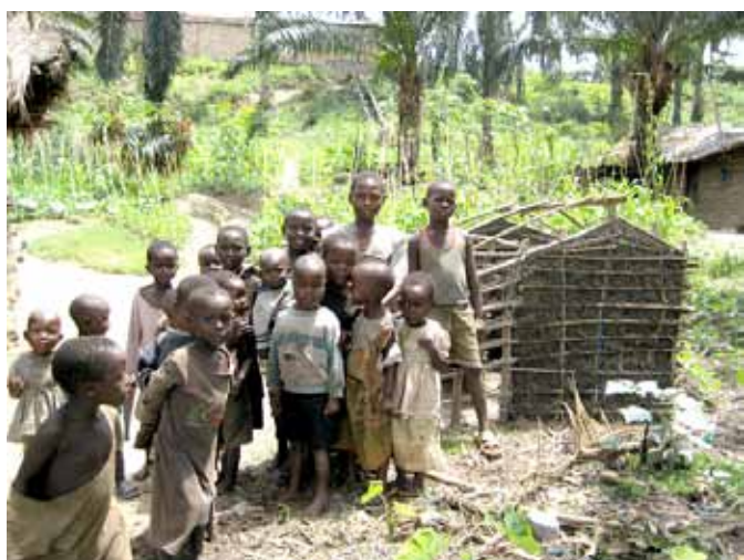
Internally displaced children at the Minago IDP site are taught to build houses from scratch. (IDMC, November 2011)

In August IDMC published an update of its profile on internal displacement in Burundi, with an overview in English and French. The update highlighted the situation of up to 100,000 IDPs in settlements in the north and centre of Burundi. The profile detailed how, in addition to the many difficulties shared by the rest of the population, IDPs lack security of tenure in the settlements they live in, and many are far from the land on which they depend for survival. It also focused on the latest government measures to foster durable solutions for IDPs in the country, including the adoption of a national strategy to reintegrate the people affected by the conflict, and the establishment of a technical group comprised of national and international members to guide its implementation. www.internal-displacement.org/countries/burundi/overview