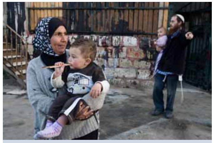
Displaced family in Sheikh Jarrah, East Jerusalem. (© Activestills/Anne Paq, February 2010)

IDMC supported Activestills – an Israel based photo collective - to raise awareness of the Israeli public on the situation of displacement in the OPT or Israel through photo exhibitions held in Tel Aviv, Haifa and Jerusalem in June 2011. In recent years Israelis experienced temporary displacement during periods of conflict, Bedhouin communities were displaced within the southern Negev region, and Arab Israelis in Galilee and in "mixed cities" such as Jaffa and Lod have been vulnerable to forced displacement. However, the situation of Arab Israelis and Palestinians displaced in the OPT by policies of the Israeli government is little known. The pictures highlight the living conditions of displaced communities. They seek to generate debate among the Israeli public and press with the aim of decreasing public support of policies which generate displacements.