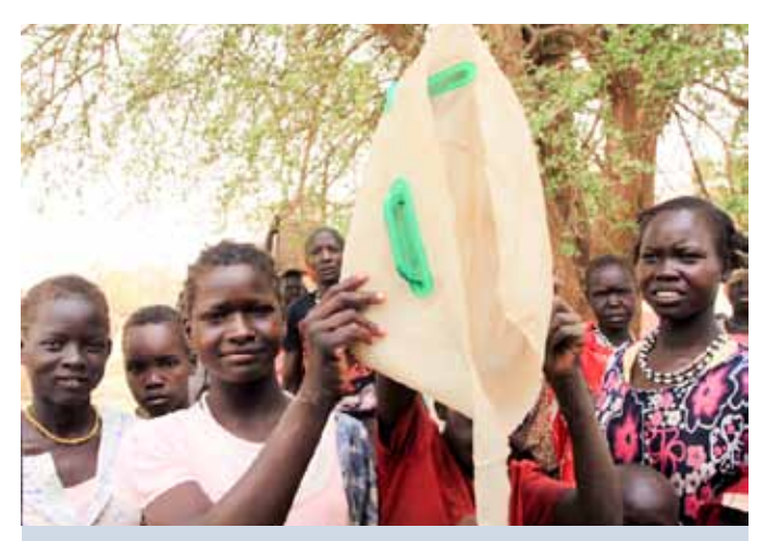
Assistance to returnees in Sudan should be useful and appropriate to use. This women is holding a jerry can that was part of a non-food items kit that lasted less than a month.

highlighted access to land, to education, to basic services and livelihoods as the main obstacles to reintegration faced by IDPs returning from Khartoum. Among other recommendations, IDMC called on the Government of Southern Sudan to give returnees a genuine choice to settle where they want in Southern Sudan and to provide or facilitate the delivery of humanitarian assistance to returnees.The document is available at: www.internal-displacement.org/briefing/ south-sudan