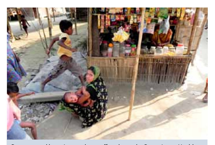
Pregnant and lactating mothers suffer a lot as the Bongaigaon Health Centre, the nearest health facility, is about 10km away from the camp. (© Anjuman Ara Begum, March 2011)

IDMC visited India in March and April 2011 to gather updated information on internal displacement in the country. The visit specifically focused on violence-induced displacement in the north-eastern region, including the situation of displaced children there. 50,000 people were displaced by inter-ethnic violence in the Assam-Meghalaya border area during December 2010 and January 2011. In addition, tens of thousands of people remain in protracted displacement in Western Assam, but little is known about their needs. Negotiations about durable solutions for long-term IDPs from Mizoram who are staying in Tripura are ongoing. Displaced children in the region have limited access to basic necessities and education, and schools were routinely used as IDP camps.