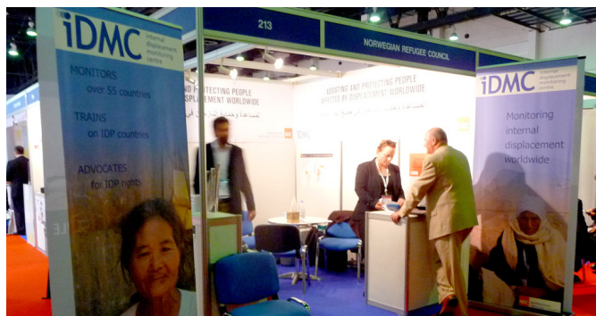
The IDMC/NRC stand at the Dubai International Humanitarian Aid & Development Conference & Exhibition conference.

In March, IDMC participated with NRC in the Dubai International Humanitarian Aid & Development Conference & Exhibition (DIHAD) in the United Arab Emirates (UAE). Over three days, IDMC/NRC ran a stand at the exhibition centre and met hundreds of policy-makers and humanitarian practitioners working in the region. NRC presented a paper at the conference on the DIHAD 2011 theme of the impact of new technologies on humanitarian and development operations. IDMC expects an increased awareness of its work in the region as well as strengthened engagement with potential partners and donors. More information is available at: www.internal-displacement.org/events/dihad