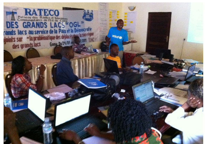
UNICEF child protection officer discusses the protection of displaced children as part of the training provided to journalists in Goma. (IDMC, January 2011)

Following the thematic sessions, participants produced a series of radio programmes, including on the Kampala Convention and the situation of IDPs, in particular in areas of settlements around Goma. All these programmes were broadcast by the 12 radio stations and can be downloaded from the website of the "Echos des Grands Lacs", the sub-regional news agency created by these radios with the support of Panos Paris: www.echos-grandslacs.info