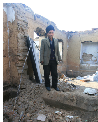
The extent of the damage done to this returnee's house means he must rebuild his home from scratch, Kyrgyzstan.

In February, IDMC published a new overview on Kyrgyzstan. Most of the people internally displaced in June 2010 have since returned to their places of origin. The government's response has been compromised by its lack of funds and limited local capacity. International humanitarian organisations rolled out a formal cluster approach, which has responded to the most urgent needs of the affected population.