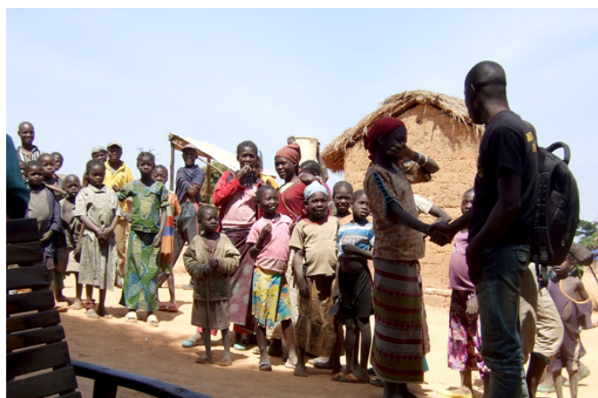
Internally displaced children in Dolko, Central African Republic.

IDMC continued to support the collection of data on IDPs, as a member of the steering committee of the Joint Inter-Agency Profiling Services (JIPS). During this quarter, JIPS provided remote tech-