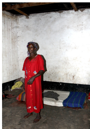
Abandoned houses in Central Equatoria, Southern Sudan, have been occupied by IDPs which has created disputes over land plots between returnees and IDPs.

In August, IDMC briefed a group of donor missions, UN agencies and NGOs on the situation of displacement in Southern Sudan, following a mission carried out in June and early July.