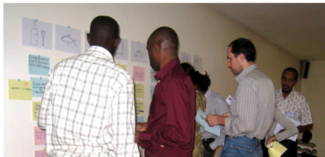
Participants at the workshop in Senegal are familiarized with a technique to generate consensus in a group. (IDMC, July 2010)

Participants mentioned that they had gained an improved knowledge of the cluster approach, coordination and leadership techniques and protection analysis and planning tools such as the risk equation and actor mapping.