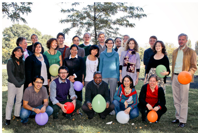
IDMC team, September 2010.

At the end of September, the whole of the IDMC team came together for one week of joint discussions and planning to review strategic objectives and plans for 2011. The need to ensure that relevant areas of work come together to feed into effective country, regional and thematic strategies ran through the discussions. IDMC's will consult donors on 16 November 2010 for feedback on its proposed plan for 2011.