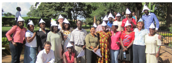
Participants at the Uganda ToT workshop. (IDMC, September 2010)

The ToT used IDMC modules on protection of human rights of IDPs and encouraged participants to adapt training implementation to the context of Uganda, with a special emphasis on durable solutions. During the ToT, participants were trained on adult learning methodology, practiced the different phases of providing training and received feedback from other participants and the facilitators. The ToT resulted in a pool of trainers who are expected to deliver short training courses on IDP protection within their organisations and externally to other national stakeholders.