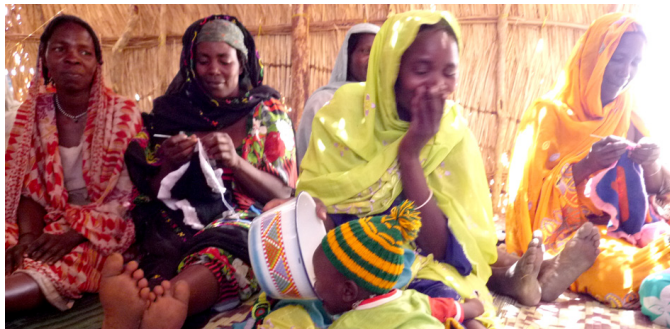
Women from the Aradib IDP camp gather weekly to share concerns about insecurity, violence in the camps and lack of livelihood activities. (IDMC, April 2009)

In September, during a conference held in Oslo entitled “Gender in Humanitarian Assistance 2010: Do we pass the quality test?”, IDMC gave a presentation on the problem of violence against internally displaced women and girls in eastern Chad. The objective of the Oslo conference was to review how gender has been mainstreamed by humanitarian organisations in field operations.