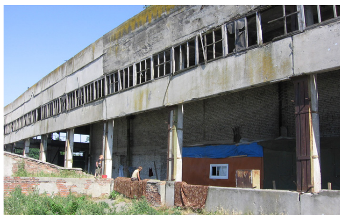
Former car factory where IDPs from Chechnya have been living for over 10 years.

IDMC conducted a mission to the Russian Federation in July. The objectives were to collect information on the situation of IDPs inside and outside the North Caucasus and to make contact with local and international organisations currently assisting IDPs there. During the mission, IDMC referred one case of imminent eviction to UNHCR since the group of IDPs did not have alternative accommodation or friends or family to stay with. UNHCR contacted the regional ombudsman and a local NGO, who committed to providing legal assistance and registration of the group with the housing department. Following the mission, IDMC presented a briefing paper to donor missions in Geneva in September. The paper raised issues concerning the lack of permanent housing, personal documentation, psychosocial assistance and consultation of IDPs, as well as their limited freedom of choice of residence. The briefing paper is available at: http://www.internal-displacement.org/briefing/russia