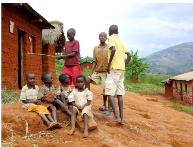
Burundi children at the Ruvubu IDP site, Karuzi province, Burundi.

IDMC's report on IDPs in Burundi, which followed a mission to the country, includes detailed recommendations on how to foster durable solutions for IDPs in settlements scattered across the north and centre of the country. The report was shared in September in Bujumbura among the members of the group on Rural Integrated Villages, a forum comprised of national ministries, international agencies including UNHCR, and donor governments. The NRC Burundi office reported that members of the group had found the report very useful for their work on IDPs, which will be further developed in a planned IDP working group. The mission report is available at: http://www.internal-displacement.org/briefing/burundi