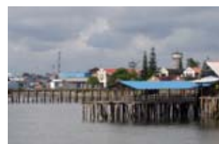
The town of Tumaco in the Pacific Coast, highly exposed to natural disasters, Colombia (IDMC, June 2010)

In June, IDMC went to Colombia to gather data for the paper. IDMC met managers of DESINVENTAR, a database of natural disasters, officials at the National System for Attention and Planning in Natural Disasters, UN OCHA and others. In Nariño department, IDMC interviewed local government officials, NGOs and people affected by the last flood season.