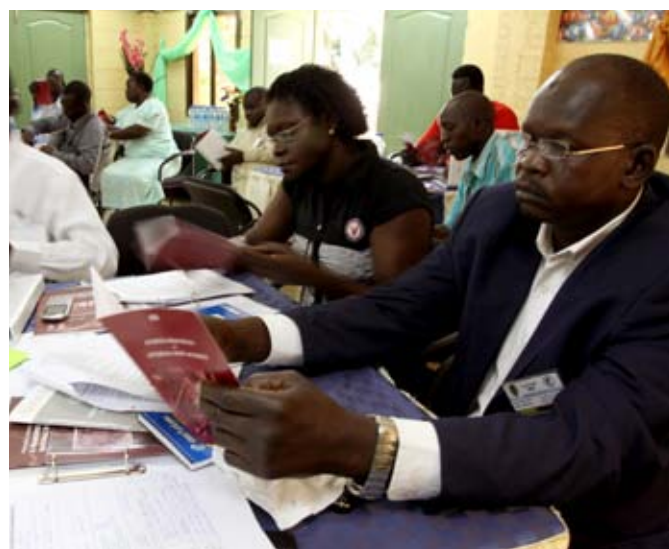
Participants using the UN Guiding Principles in one of the workshop exercises, Juba, Southern Sudan (IDMC, June 2010).

Within the context of the IDMC-Brookings partnership, IDMC conducted a 3-day training workshop on the protection of the human rights of IDPs. Using the UN Guiding Principles, the training concentrated on prevention of arbitrary displacement and the protection of IDPs during and immediately after displacement, with special attention given to women, children and other extremely vulnerable individuals. A session on durable solutions was also conducted with an emphasis on local integration as well as land issues. The workshop concluded with a strategy session that looked at the ways and means to incorporate the learning of the participants into the programmes of work of the two commissions, including how they can work together at state level.