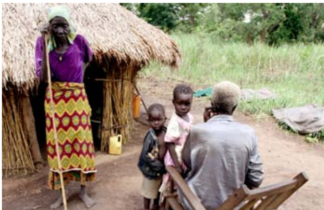
Elderly IDPs watch over their grandchildren while the mother cultivates the field, Kirikwa, Sudan (IDMC, June 2010).

The update pointed to the weak international and national response to internal displacement in Sudan