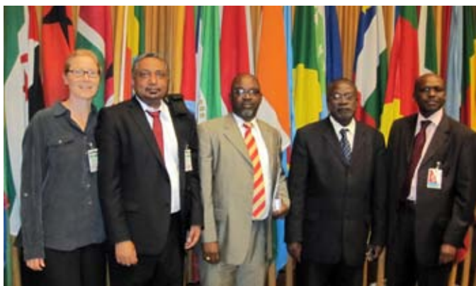
IDMC with Uganda's Minister of State for Disaster Preparedness and Head, Humanitarian Affairs, Refugees and Displaced Persons Division of Political Affairs Department. (IDMC, June 2010)

From 1 to 5 June IDMC attended a meeting of experts and ministers responsible for responding to forced displacement, organised by the African Union Commission. IDMC met some of the delegates from AU Member States to lobby for the signing and ratification of the African Union Convention on IDPs (Kampala Convention). See section on training p.7 for further information on the Kampala Convention.