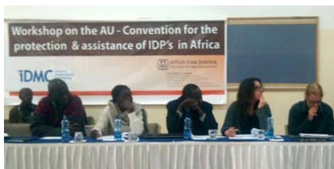
Participants at a workshop on the AU Convention on IDPs, organised by IDMC and the Kenyan NGO Kituo Cha Sheria in Nairobi (IDMC, June 2010).

The media was invited to the opening session of the workshop, which resulted in strong media coverage by Kenyan TV stations as well as national newspapers.