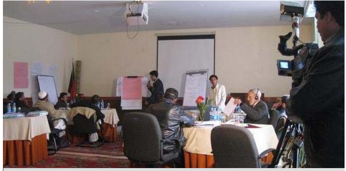
Two participants are filmed while conducting a training session at the Kabul workshop, which they will review on video afterwards ( Photo: IDMC, February 2010 )

This workshop was a continuation of the training plan initiated in 2009 and aimed to ensure that training is also delivered in areas of displacement and return. Under the coordination of NRC Afghanistan, participants will conduct further workshops on the protection of IDPs in provinces, including Balkh, Herat, Jalalabad, Kandahar, Nangarhar, and Paktia, where most of them are based.