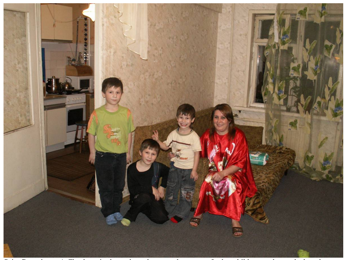
Saint Petersburg: A Chechen single mother who struggles to care for her children as she works long hours as an apartment renovator. They lived in an abandoned apartment (from which they were evicted) and a cellar until she was able to afford the rent for this apartment.

The majority of IDPs interviewed have some form of work, but only a minority in the official market. IDPs without residence registration work in the unofficial labour market. One woman in Saint Petersburg was offered work in an insurance company, but could not accept it because the salary was paid only through a bank account and she could not open a bank account without residence registration. People who were highly educated and had previously worked as engineers, university professors, ambulance attendants and librarians, said they were now working as cleaners, cooks, construction workers, dishwashers, flyer distributors, childcare providers and market salespeople. In Veliki Novgorod IDPs were also working in a fish processing plant. Most displaced pensioners interviewed were working as cleaners and bus drivers to supplement their low pension.