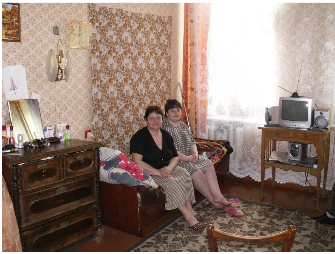
Rostov: This family had applied to the European Court of Human Rights on their eviction from previous housing. The young girl was working as an ambulance attendant while studying to help pay the rent.

IDPs in employer-provided housing and the private sector had also experienced eviction. In Rostov, IDPs living in dormitory rooms provided by their employer were under pressure to leave as the building was being handed over to the municipal authorities; they were not being offered alternative accommodation. IDPs living in the private sector in Saint Petersburg and Rostov explained how they had been evicted from the housing which they had rented on the basis of verbal agreements which offered no protection. In Rostov, the eviction had been on the basis that someone else allegedly had rights to the apartment, while in Saint Petersburg the municipal authorities had claimed they owned the apartment. After having exhausted local remedies, two IDPs had applied to the European Court of Human Rights about their eviction, but the Court had yet to reply on whether it would admit their cases.