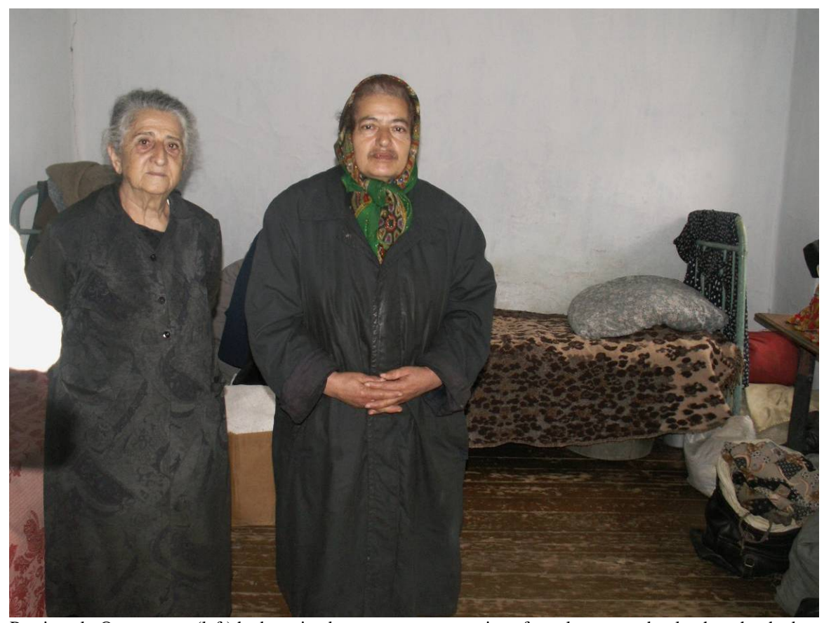
Pyatigorsk: One woman (left) had received property compensation after a long court battle, the other had refused property compensation and was waiting for a government housing certificate.

for the apartment upon return to Chechnya, he traveled with security guards and never slept in the same place more than once.