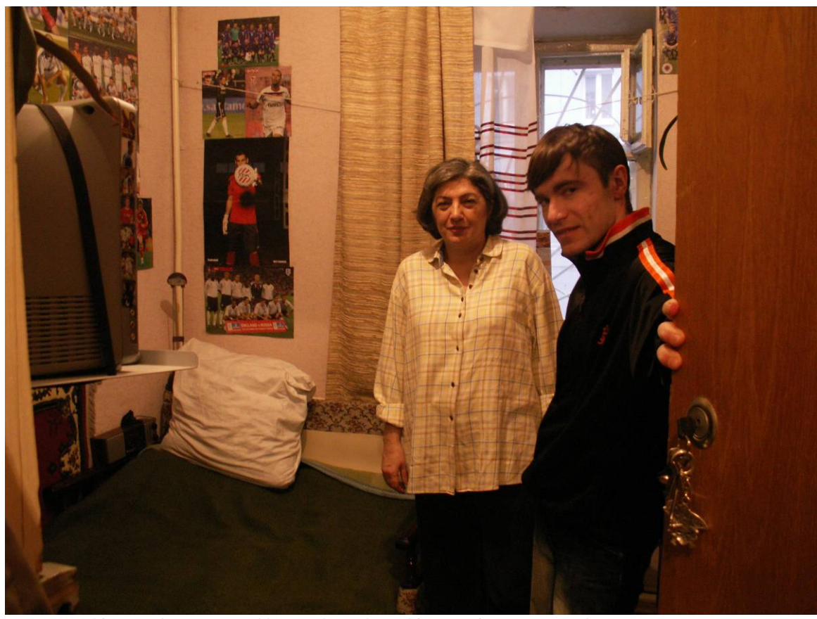
Moscow: This Ingush woman and her nephew share this room in a communal apartment

IDPs living in TACs were concerned about evictions. Those who had received property compensation were protected by a Supreme Court ruling of 2002, but the tenure of those who had not received property compensation and who had lost forced migrant status was at risk. The loss of forced migrant status serves as grounds for evicting IDPs from TACs since the status is the legal basis for which the state should provide them with housing. Article 9.6 of the law on forced migrants states: