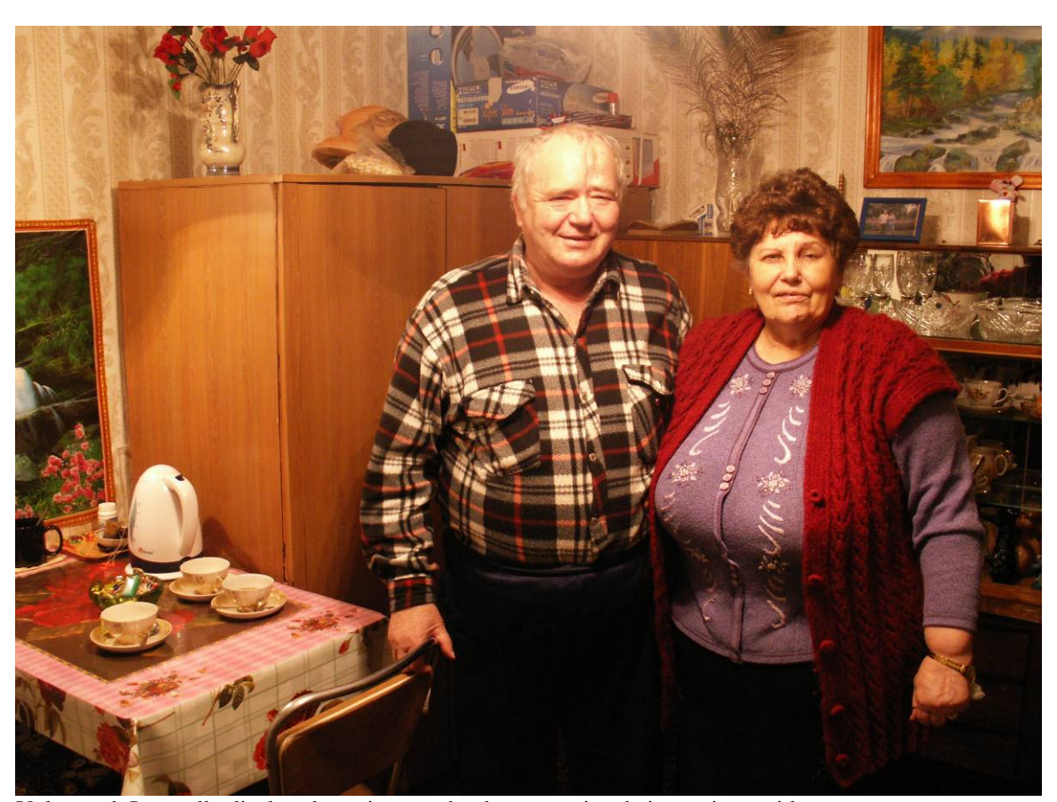
Volgograd: Internally displaced pensioners who do not receive their pension entitlements

The average monthly pension in Russia at the end of 2007 was about $140 (3,300 roubles)<sup>30</sup>. Most internally displaced pensioners interviewed were receiving a monthly pension of approximately $85 (2,000 roubles) and were struggling to make ends meet. Some were receiving less, and only a few were receiving the pension they were entitled to. Most reported that they had to work full-time to pay all their bills and cover their expenses.