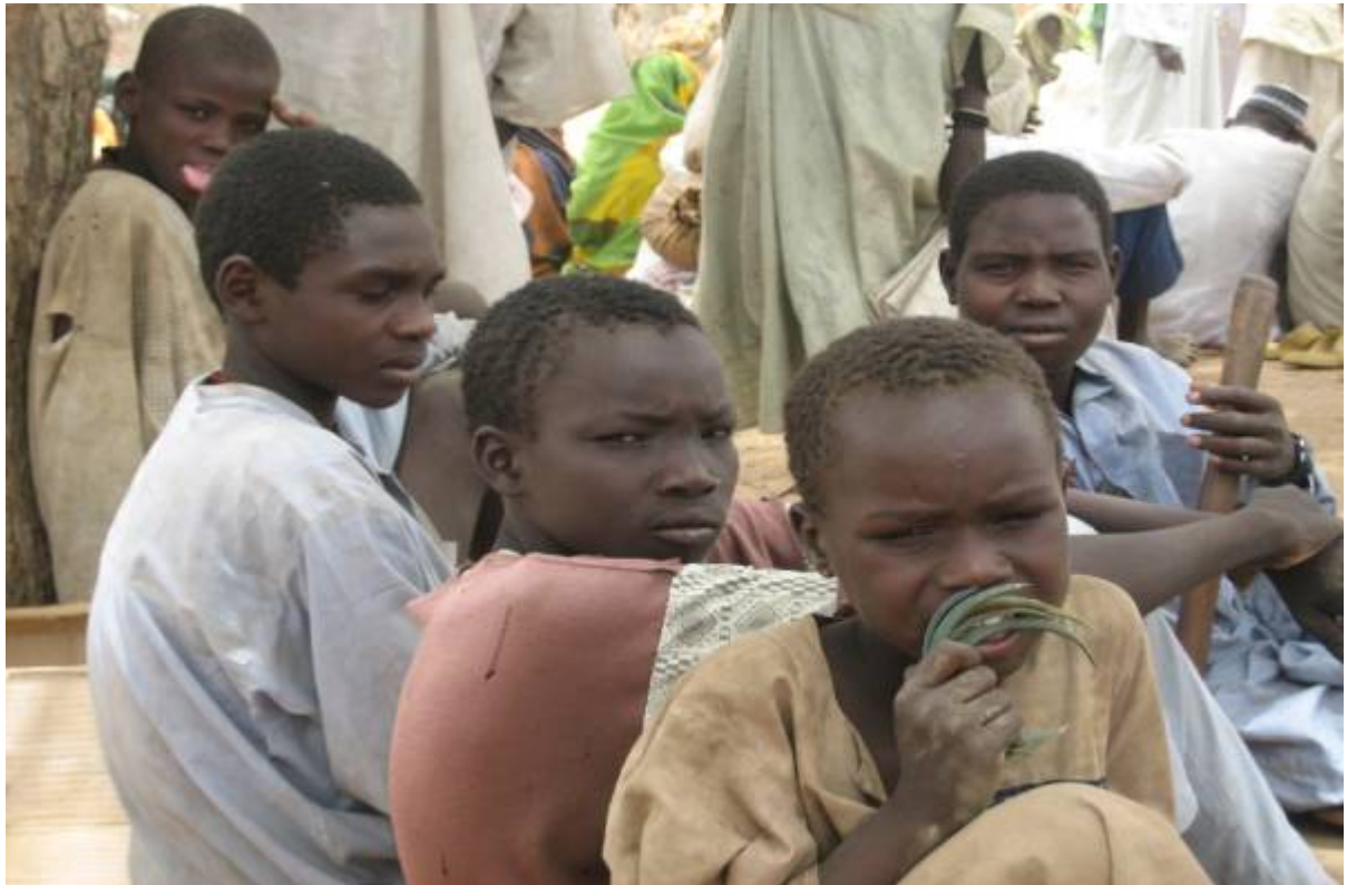
Young boys waiting for distribution of government provisions in Gassiré site, 28 April 2007