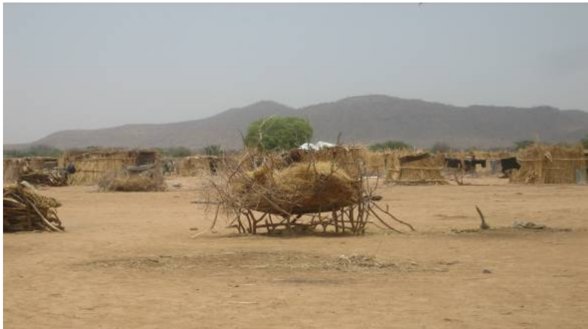
Gassiré IDP site, 28 April 2007

The criteria used by the government to locate IDP sites have to be reviewed in order to avoid tensions between the displaced groups themselves, and with host communities. In view of the limited resources available, the continued presence of Sudanese refugees and IDPs has caused unrest between the displaced and host populations. 31 In Farchana and other areas of the Dar Sila, some sites are located on flood-prone areas on land generally cultivated by host populations. Some IDP sites, as well as refugee camps, are very close to Arab villages and can only add to the tensions that already exist between the communities. In addition, the concentration of newly displaced people close to refugee camps and IDP sites has put enormous pressure on resources such as water, firewood and pasture land, and friction between IDPs and host communities is recurrent. 32