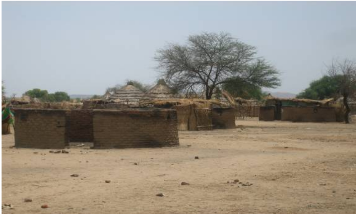
Burned houses in Aradib village, 29 April 2007

ground and their inhabitants have lost all their assets, including livestock and food supplies. 17 Attacks on humanitarian aid workers and cases of theft of humanitarian personnel's vehicles are also reportedly on the rise. 18