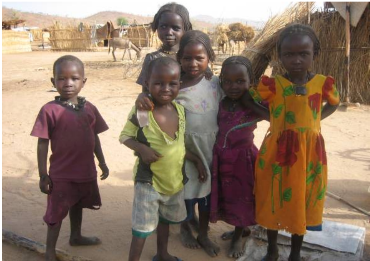
Displaced children in Gouroukoun site, 28 April 2007

Where schools still function, major challenges exist. Recurrent attacks on villages force schools to cancel classes. There is usually no registration processes, which makes it hard for teachers to track students. To solve that problem and track students during waves of violence, for example, the Jesuit Relief Services helped to create a student registration system. 46 As schools were closed or abandoned, a number of children joined militia groups or the army and others may have been forcibly recruited. 47