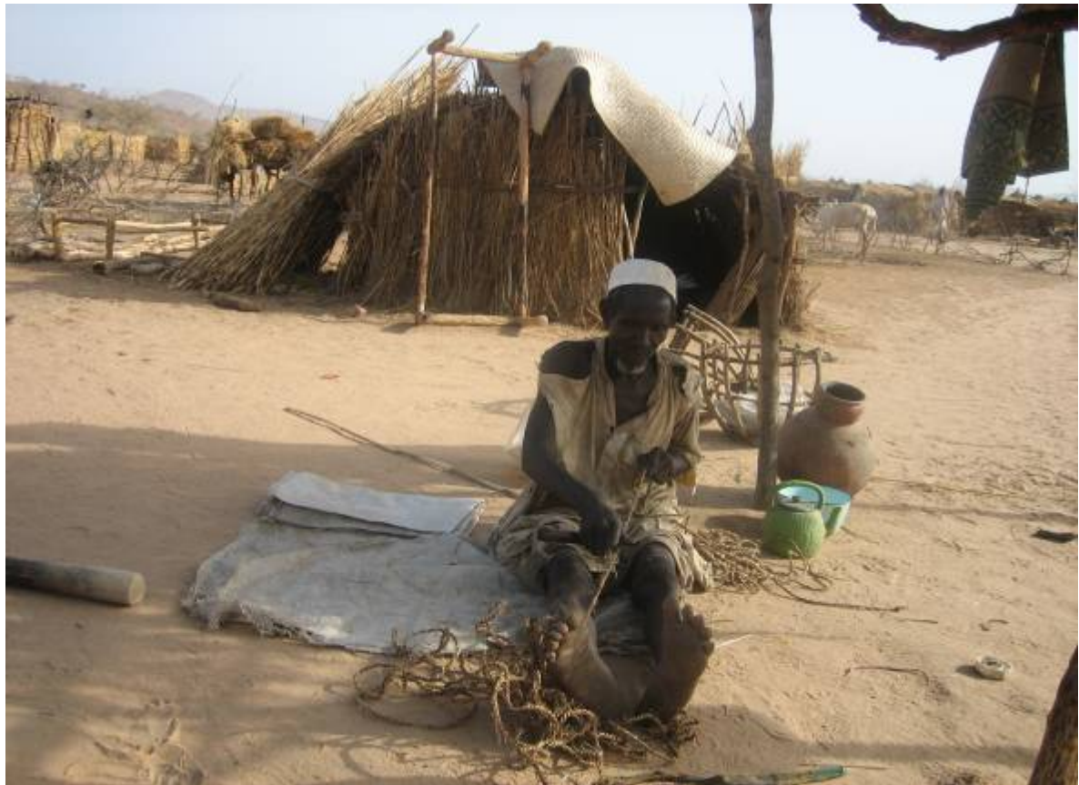
An elderly displaced man constructs a bed in Gouroukoum IDP site, 28 April 2007

The ongoing and unpredictable crisis, the incapacity of the national authorities to tackle the increasing security concerns and the deterioration of the socio-political environment are all hampering IDPs' enjoyment of basic rights, and their access to a livelihood. 34