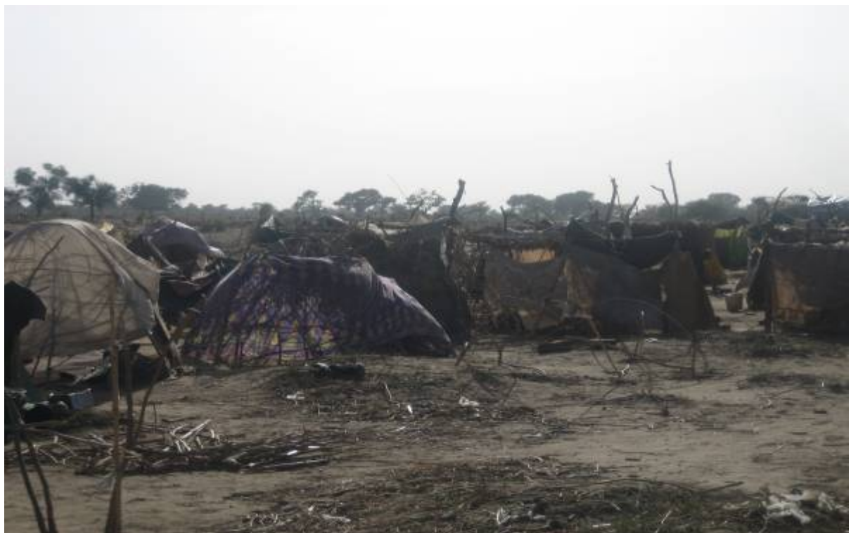
IDP shelter for newly arrived in Habilé III site, 29 April 2007

Access to healthcare services in IDP sites and areas of refuge is difficult. Few viable medical centres are available and medical personnel is lacking. Overcrowding in IDP sites and the difficult living environment have a negative impact on IDPs' health condition. Displaced families are living in makeshift shelters, which will not protect them from the rains during the rainy season from June to September. Given the poor quality of shelter and lack of access to clean water, there is a growing risk of malaria and diarrhoea caused by water-borne diseases such as hepatitis E. This risk will further increase during the rainy season. 39 An increase in diarrhoea cases has already been registered in the IDP sites of Habilé III and Koloma and of hepatitis E in Koloma and Gouroukoun IDP sites. 40 Access to certain areas such as Abdi is restricted and, consequently, the provision of medical care is limited and IDPs' health situation is precarious. 41