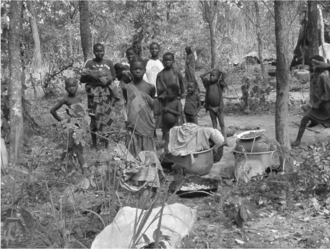
IDP settlement in a forest, November 2006

Many of the displaced are located in isolated settlements. They are camping in temporary huts or under the open sky, without protection and exposed to diseases. They may come back to their village to retrieve water when security allows such movement. In the bush, there are reportedly civilians still internally displaced as a result of the conflicts of 2002 and 2003. 13