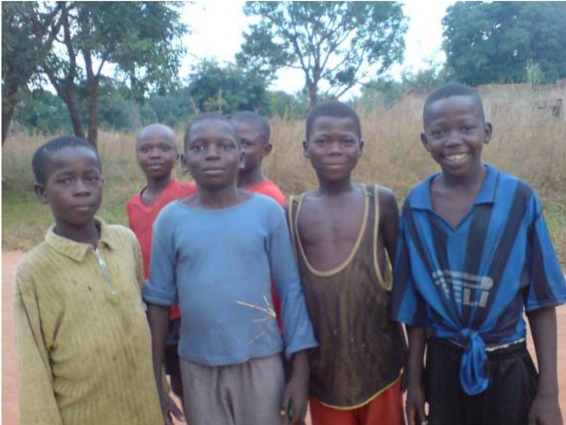
Displaced children, November 2006, (Photo: ICVA)

No emergency education has been provided to children currently living with their parents in the bush. In the five conflict-affected prefectures bordering Chad, there are some 290,000 school-age children – including 140,000 girls – of whom more than one-third have no access to education. As mentioned earlier, there are some 70,000 internally displaced children in the CAR, out of which it is known that 30,000 displaced in 2006 have had no access to education. It is unclear if the rest of internally displaced children are among the 100,000 children who have had no access to education in 2006 due to the closure of schools as a result of insecurity. 34 Furthermore, in the communes of Nana Barya, Babessar and Mia Pende, at least 20,000 children have missed the 2005/2006 academic year and will miss the next one too. 35 Even in some areas where civilians have reportedly been able to return, parents are reluctant to send their children to school – considered an easy target in case of attack. They prefer to keep their children at home in order to be able to flee with them in case of danger. 36