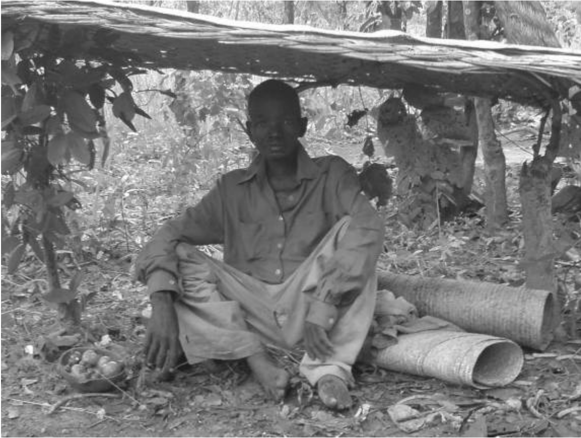
A displaced man in his shelter, November 2006

One of the main challenges is to provide IDPs in the bush with provisional shelter in order to ease their living conditions without making their situation permanent. In some cases tarpaulins distributed to IDPs have exposed them to further attacks by the army and the rebels because they became more visible. Some displaced need local materials to build their shelters. 42