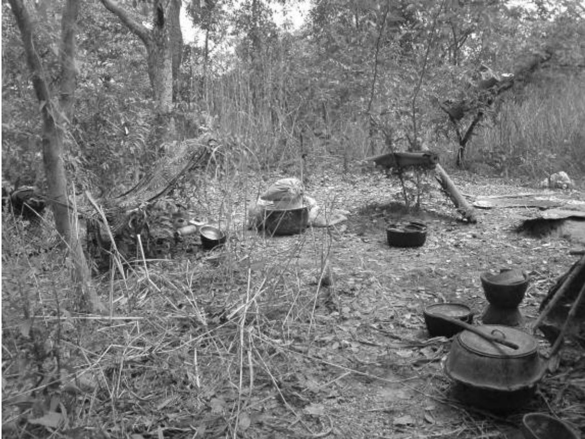
IDPs belongings in an isolated settlement, November 2006, (Photo: ICVA)

The humanitarian conditions of the displaced are generally worse than that of the general population, as they often are isolated from areas where services are provided and are living where there are no civilian authorities. 32 Additionally, internal displacement-affected areas are those where public infrastructures and private property, including dwellings and livestock have been stolen or destroyed.