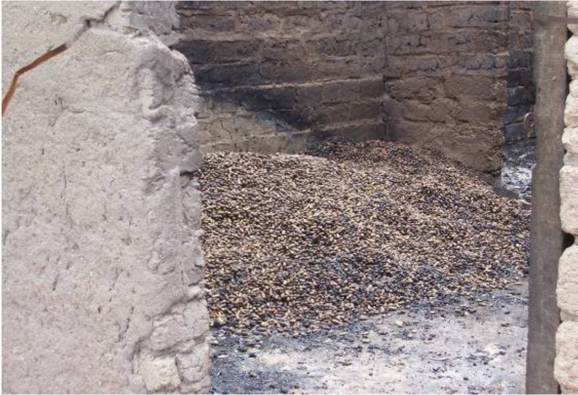
Burned seed stocks, October 2006, (Photo: COOPI)

Afraid to move about, IDPs and people affected by the conflict have reduced their everyday life activities. Consequently, their temporary plantations produce limited quantities. 50 Recent attacks have targeted food supplies, just a few weeks after the harvest, leaving villagers with almost nothing on which to survive until they can harvest again, late in 2007. 51