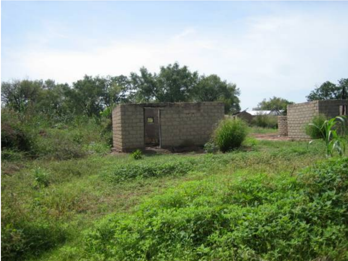
Burned houses in Béboua, October 2006, (Photo: Mpako Foaeng/IDMC).

the beginning of October 2006 some 27 villages were attacked and burnt by the Presidential Guard. 23 Over the past year, more than 100 villages have reportedly been burnt down by different parties to the conflict. Previously, in December 2005, more than 900 homes were burnt in about ten villages in the Markounda area, while some villages were completely destroyed. 24