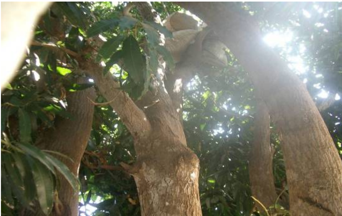
Food stocks hidden from army and rebels, Markounda, February 2006, (Photo: COOPI).

There is a pattern of rebel groups occupying a village and looting the possessions of inhabitants. This triggers the intervention of the army, mainly the Presidential Guard, which usually enters the village a few days later, pillaging what has been left by the rebels, burning down houses, and harassing the inhabitants who the army accuses of supporting the rebels.