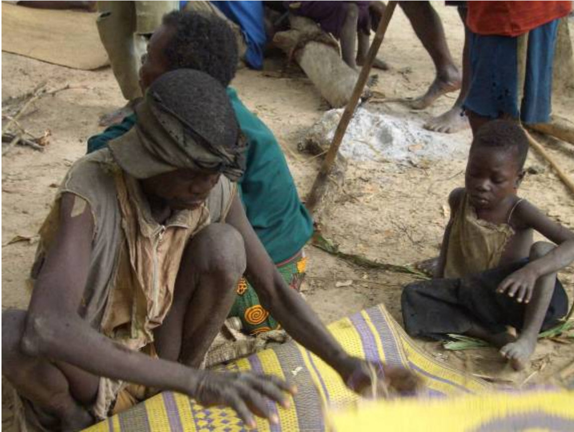
IDPs in a settlement, November 2006, (Photo: OCHA)

The deterioration of medical facilities shows the precariousness of IDPs' health situation. The displaced are living in the bush with no access to drinkable water and sanitation facilities. They are exposed to diseases such as diarrhoea and malaria which are important in flood-prone areas of the north especially between the months of May and October every year. Moreover, since they are scared of moving about, IDPs have little access to health structures to get treated. Some displaced people hiding from government forces are reported to have died from wounds they had sustained during attacks, from snake bites and from illnesses for which they could not access medical care in the bush. 44 Women and children are particularly affected. While nationwide less than 50 per cent of children are vaccinated against transmissible diseases, in conflict-affected areas this rate is much lower. 45