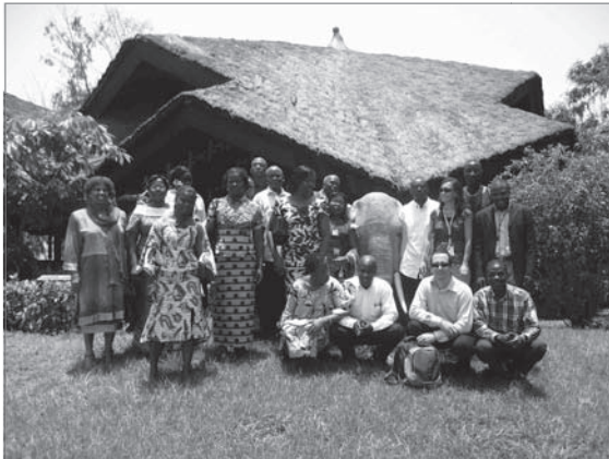
Qualified trainers who have successfully completed a Training of Trainers workshop facilitated by IDMC in Côte d'Ivoire.

and that they used the modules to train their own organisations. Göc Der, a major IDP solidarity network in Turkey, also organised two workshops at the community level. However, it should be noted that financial constraints have hindered many NGOs from conducting more workshops on their own. UNDP Turkey has therefore continued its efforts to get more support from the donor community to help Turkish NGOs to develop follow-up training activities.