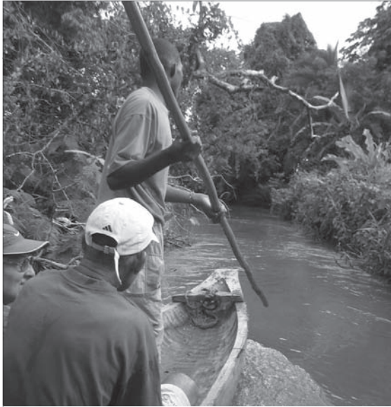
IDMC fact-finding mission to Colombia in September 2006. (Photo: Arild Birkenes, September 2006)