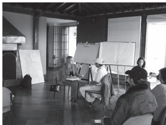
Participants in the Life Story Project, Colombia.