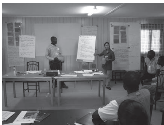
IDMC facilitated 20 workshops in 13 countries in 2006. This photograph was taken at a training of national actors in Sudan.

The IDMC supported the development of training resources among NRC field offices. A training of trainers was organised for NRC staff members coming from 12 different country operations and engaged in protection training activities. IDMC training modules were distributed to the participants and used by them during the workshop to conduct training sessions. The training greatly enhanced the skills of the participants, in particular with regard to participatory techniques and interactive exercises. The training was also an opportunity to share the experience developed by NRC Georgia regarding training on the Guiding Principles for displaced communities. This experience based on forum play, a training approach involving drama, has proved very successful in raising awareness of their rights among the displaced population and reflecting with them on practical ways to enforce them.