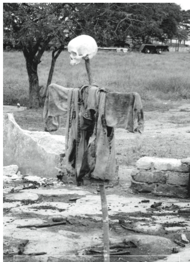
Remains of a RUF rebel in burnt out house, Makeni-Kono road, Sierra Leone, 1997

President Ahmad Tejan Kabbah first took office in 1996 in war-time elections, was toppled in a military coup one year later, and was subsequently reinstated with help from West African peacekeepers and British troops. At the beginning of 2002, with a large UN mission deployed across the country and disarmament completed, Kabbah declared the war to be officially over – just four months ahead of presidential elections that won him another five year term in office. By this time resettlement was proceeding at full speed. Displaced Sierra Leoneans were resettled in accordance with the national government's Resettlement Strategy, which applied to IDPs as well as refugees and ex-combatants with their dependants, and was meant to apply only when resettlement areas were "sufficiently safe to allow for the return of displaced people in safety and dignity". UNHCR was one of numerous agencies that helped to plan and implement the strategy, aiming to harmonise the resettlement of refugees and IDPs. Both groups were offered resettlement packages, which included a two-month food ration, household utensils, plastic sheeting, and in some cases, transportation. Some 220,000 registered IDPs were resettled in several phases in 2001 and 2002. Many more returned home spontaneously. Officially, at least, this left no more IDPs in Sierra Leone.