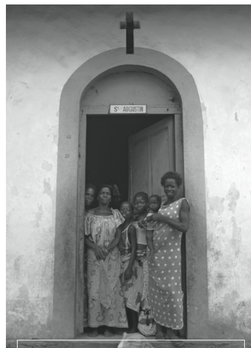
IDPs taking refuge at the Duékoué Catholic Mission, Côte d'Ivoire, 2005

Important protection issues have also been raised by the premature return of IDPs to their areas of residence in the western region. Although landowners have in some cases encouraged the return of IDPs to prepare for the start of the agricultural season, local populations have reportedly been alarmed and frightened by the return of "non-native" settlers. Likewise, some IDPs are