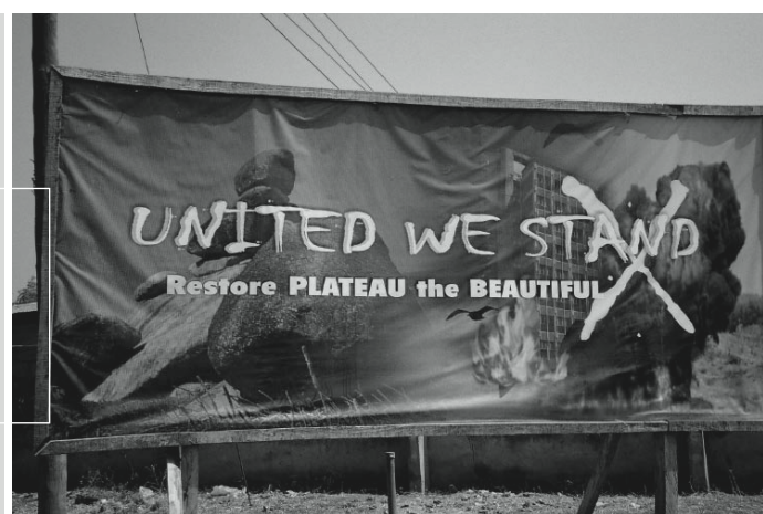
Billboard in Plateau state, Nigeria, 2004

While some of these conflicts may appear to be caused by a single factor, such as religion or ethnicity, the reality is usually more complex. The introduction of Islamic Sharia law in a total of 12 of Nigeria's 36 states in recent years has caused tensions, but when Muslim and Christian groups have clashed this has usually been caused by other factors – such as pressure on land or unequal access to social services. However, the polarisation that follows is often along religious lines, and the conflict is easily stereotyped as a “religious war”. The same dynamic is often observed with regard to “ethnic conflicts”.