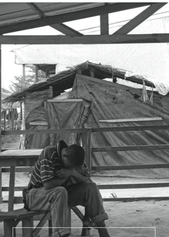
Displaced man in Guiglo IDP camp, Côte d'Ivoire, 2005

unwilling to return before disarmament takes place. In some cases where return has been encouraged, for example by the UN's pilot return project in the village of Fengolo, returnees have found their plantations occupied, resulting in dangerous inter-community tensions and urgent calls for local peace and reconciliation work