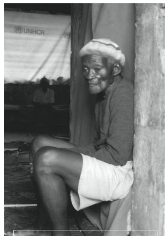
Displaced man in Monrovia, Liberia, 1995 (Claudia McGoldrick)

The humanitarian situation of IDPs remaining in camps has also continued to be grim. With the official IDP return process expected to end in April 2006, many camps have been closed, the huts demolished and services such as health posts largely reduced. According to some NGOs, the conditions in the remaining camps – including those officially closed but still housing thousands of unregistered IDPs (ie. those without a valid food ration card) – are deplorable. Not only have service providers been pulling out of the camps, partly due to lack of funding, but landowners have in some cases been stripping the camps of water pipes and other infrastructure. Shelters are in a state of collapse, and water and sanitation facilities are seriously lacking. The absence of a clear plan for the consolidation and integration of IDPs who for various reasons do not wish to return has exacerbated the situation. Reasons cited include inadequate return packages and lack of transport, continuing security fears, and lack of infrastructure and services in home areas.