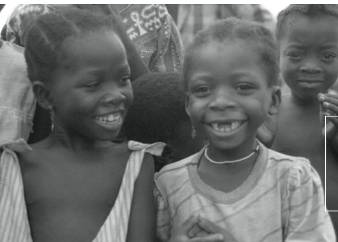
Displaced girls at Clay camp, near Monrovia, Liberia, 1995 (Claudia McGoldrick)