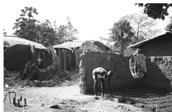
Attempts at rebuilding in Yelwa, Nigeria, 2004

Indeed, the overall fragmented response to the 2004 Plateau state crisis in particular demonstrated the need for improved coordination between humanitarian actors at all stages of internal displacement from contingency planning and preparedness right through to post-emergency rehabilitation activities. Although the Nigeria government may have the financial capacity to respond to emergencies, it lacks the necessary institutional capacity and expertise to deal effectively with acute situations of internal displacement.