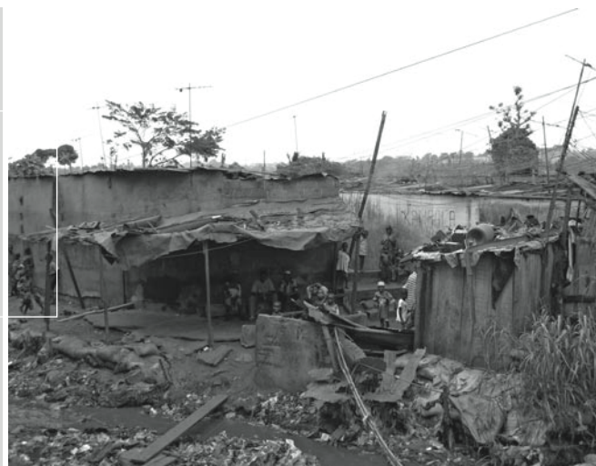
Boribana shanty town in Abidjan, Côte d'Ivoire, 2005

Clearly, the lack of information on the numbers, locations and needs of the displaced has been a fundamental obstacle to an effective response. Ongoing low-level displacement together with small-scale spontaneous return has made existing estimates less and less precise. A UNFPA-funded IDP survey, carried out in five key areas in the government zone, was completed in November 2005, with final results expected to be published in early 2006. It is hoped this will provide a clearer picture of IDPs' numbers, locations and needs.