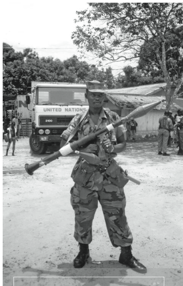
Nigerian ECOMOG peacekeeper, Tubmanburg, Liberia, 1994 (Claudia McGoldrick)

ECOWAS has also initiated regional conflict resolution efforts on a political level, in some cases with the support of the African Union's Peace and Security Council. Examples include Togo, where both ECOWAS and the AU imposed sanctions after Faure Gnassingbe was installed as president in February 2005, and Côte d'Ivoire where both organisations have been involved in facilitating peace talks aimed at securing the full implementation of the country's successive peace agreements since January 2003.