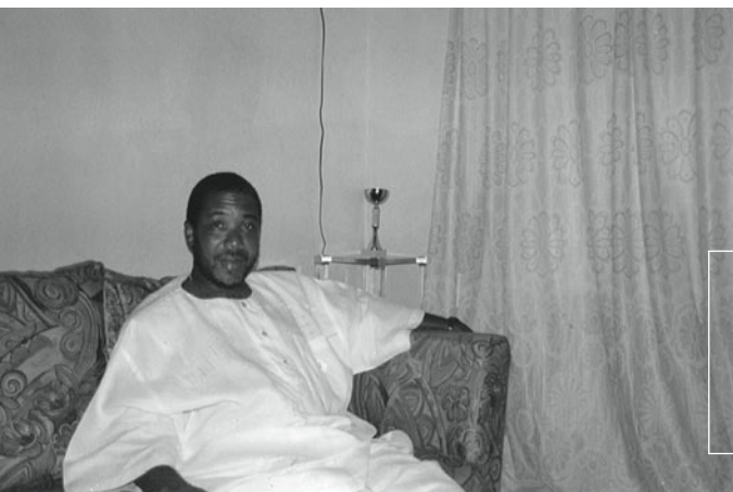
Charles Taylor, Liberian rebel leader and subsequently president, at his Gbarnga headquarters in 1994. Taylor was a driving force behind the conflict that eventually destabilised the entire region.

Taylor was also directly responsible for starting Sierra Leone's civil war in 1991, training and sponsoring the Revolutionary United Front (RUF) rebels to effectively act as his proxy in the diamond-rich areas in the east of the country. 4 What began as a small incursion from Liberia turned into a brutal campaign of terror against civilians throughout the country that cost an estimated 50,000 lives and, at its height, forced up to one third of the country's 6 million people to flee their homes.