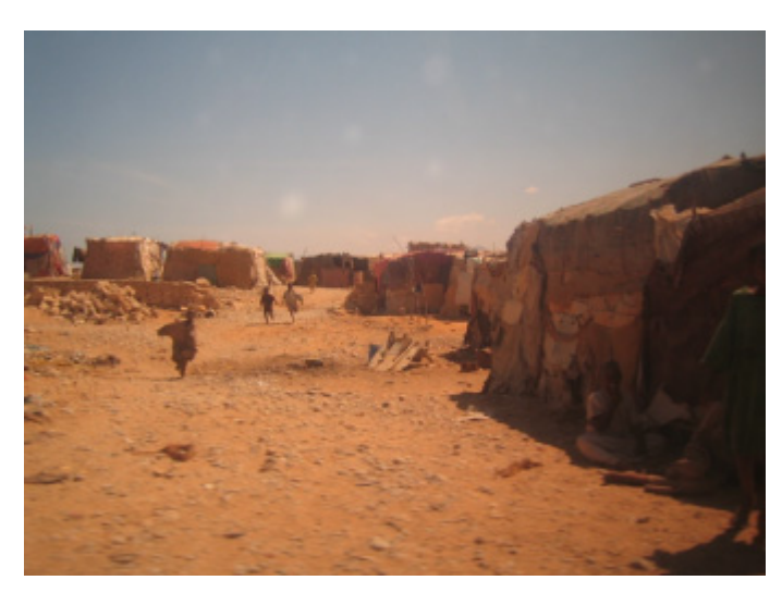
IDP settlement in Bossaso

The UN Country Team was working on setting up a Protection Monitoring Network which should enable it to monitor protection issues more systematically and signal new protection problems more quickly. The Network was expected to start functioning in 2006. IDP Working Groups have been established in Somaliland (Hargeisa) and Puntland (Garowe), both meeting on a monthly basis. While the Hargeisa Working Group seemed very active at the end of 2005, the Garowe Working Group appeared to still be in the phase of defining its role. A fourth working group is intended to be established in early 2006 for south and central Somalia.