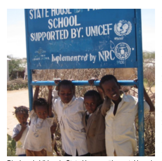
Displaced children in State House settlement, Hargeisa (Nadig/2005)

Primary school enrolment in Somalia is the lowest in the world. Only one in five children attend primary school and girls constitute roughly one third of the pupils (IRIN, 15 December 2005). Yet education remains one of the most chronically under-funded sectors in the Somalia UN Consolidated Appeal (CAP). The requirements for 2005 were only 27 per cent met at the end of the year (OCHA, 30 November 2005).