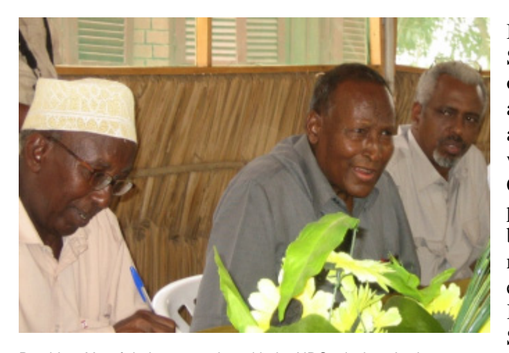
President Yusuf during a meeting with the NRC mission, Jowhar (Nadig/2005)

Given the scale of destruction and the volatile security situation in Somalia, it is premature to expect the Transitional Federal Government to have an immediate impact on the humanitarian, socio-economic and political situation. The TFG has practically no remaining government infrastructure to build on and is itself entrenched in inter-clan rivalries which limit its capacity to establish authority throughout the country and achieve durable peace. It is therefore likely that most of south and central Somalia will remain in a state of chronic complex emergency: little government authority, high levels of criminality, sporadic armed conflict, lack of economic recovery, endemic humanitarian needs, minimal health care and education, and population displacement. Operational humanitarian activities will remain ad hoc, lack sustainability and depend on security. There is hope that the talks between the government factions, initiated in early January 2006, will have a positive effect on the overall security in Somalia (Reuters, 5 January 2006).