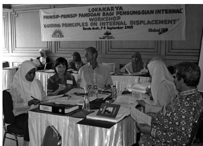
IDMC training workshop in Banda Aceh, Indonesia, September 2005

The IDP training organised at the request of SIDA targeted the higher management of Swedish humanitarian NGOs and their international partners, and was jointly organised with SIDA and the Harvard programme on Humanitarian Policy and Conflict Research.