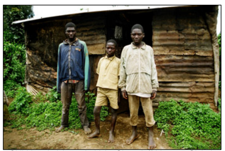
Child-headed household in Gisenyi

The situation changed drastically when the RPA dismantled the refugee camps in what was then Zaire and the Hutu refugees returned between October and December 1996. Many of the returning Hutus found their houses and land occupied by Tutsis and families from the two groups were sometimes forced to share lots (HRW, May 2001). With some reservations, the villagisation policy was largely welcomed by most of the recently returned Tutsi who either did not have any house or property or were illegally occupying other people's houses and plots. Villages predominantly occupied by old case-load have proven to be sustainable more than six years after completion (Global IDP Project visit to Umutara, 15 May 2005).