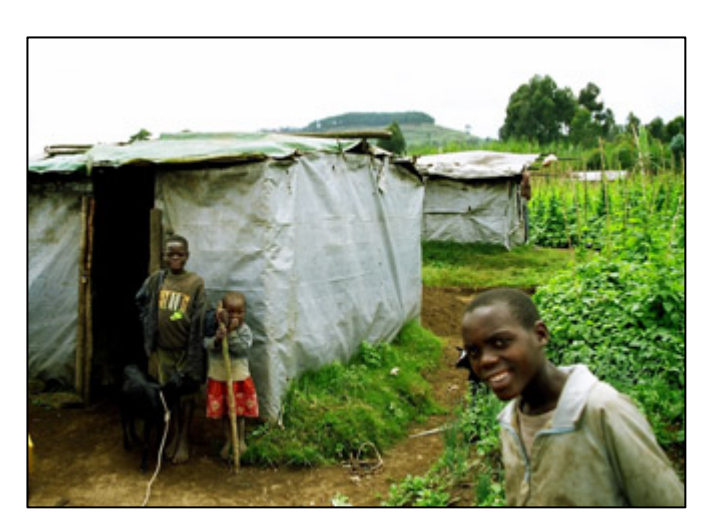
Settlement site along a road in Gisenyi

Housing and living conditions for the relocated people are considerably worse than before the displacement. The conditions in the villages and settlements are appalling, more than four years after the UN stated that "governmental and international efforts to stabilize the situation through durable solutions have advanced beyond the threshold of what still could be called internal displacement". As of May 2005, there were thousands of makeshift shelters along rural roads in Ruhengeri and Gisenyi. Many have walls of leaves and soil and roofs of plastic sheeting giving very limited protection against rain and temperatures which can drop to 10C (50F) in Ruhengeri. A majority of the households are headed by women and there is a serious shortage of man-power. The hard volcanic soil makes it next to impossible for each household to have proper pit-latrines and access to water and sanitation facilities are reported to be a serious problem in most settlements. One widow in Ruhengeri could only afford to send one of her five children to school, despite the government's Universal Primary Education scheme. She claimed to have been better off in the house she was forced to abandon in 1998 compared to her current situation. She had only been given a plot of 20 by 25 meters of arable land which was supposed to provide sufficient livelihood for her and her children.