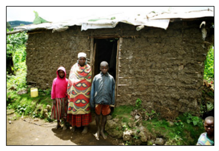
Widow with her children in Gisenyi (Birkenes, Global IDP Project)

The policy applied to all Rwandans, but has affected the different districts differently, depending on the eagerness with which it was implemented by the local authorities, the number and composition of returnees, resistance from the local population and, not least, access to international funding. A study from 2000 – soon after international donors started withholding funding – , revealed that more than 90 per cent of the population in Kibungo and Umutara prefectures lived in grouped villages, whereas Ruhengeri came third with more than 50 per cent, and Gisenyi fourth with 13 per cent. Only a very limited number of people live in villages established under the programme in the other prefectures (ISS, June 2005, p. 326). The high rates in Kibungo and Umutara reflect the high number there of largely Tutsi pastoralists who had fled to Uganda following pogroms in the 1960s and early 1970s and their descendants.