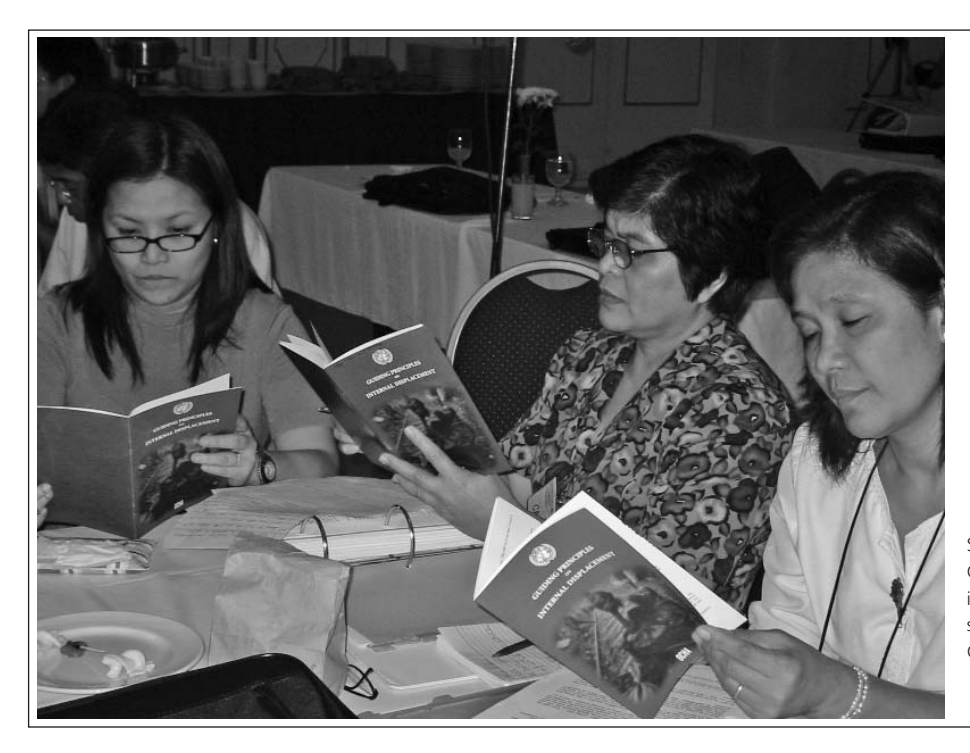
Staff of the National Human Rights Commission of the Philippines studying the Guiding Principles at a workshop in November 2004

IDPs among national and local actors, including governmental or provincial authorities, local NGOs, and representatives of IDP communities. They also served as forums to discuss issues of protection and assistance at stake in these countries, in support to UN advocacy efforts. This was the case of the workshop in Jordan, which gave national and international actors based in Jordan, lraq and Kuwait an opportunity to discuss displacement issues together. Conclusions and recommendations reached during these workshops concerned the creation of coordination mechanisms on IDPs, the relevance of