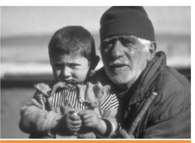
The Project promotes durable solutions to the plight of internally displaced people