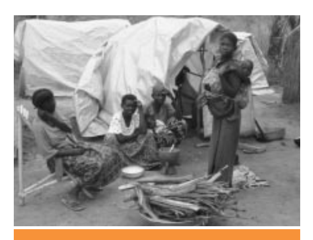
Training workshops are organized to raise awareness of international standards and assist with their implementation on the ground, for example in the DR of Congo

Training activities in 2004 will focus on strengthening the capacity of field workers serving as IDP protection focal