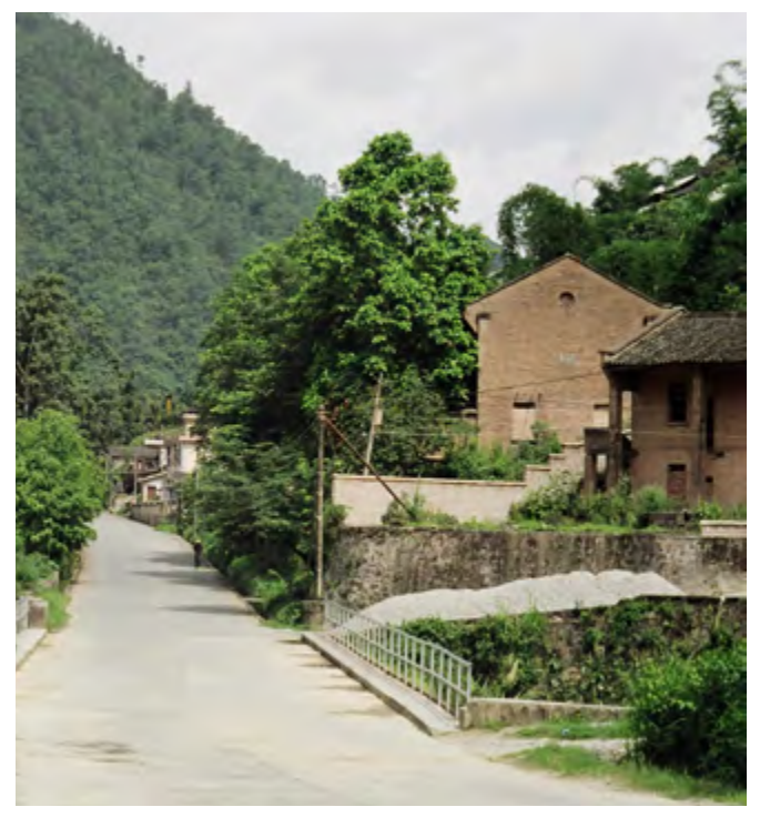
A village downstream of Manwan Dam. Photo: Bryan Tilt, 2008

The most comprehensive account of the Manwan resettlement process comes from a social and environmental impact study sponsored by Oxfam Hong Kong in 2000. Entitled Reasonable and Equitable Utilization of Water Resources and Water Environment Conservation in International Rivers in Southwest China, it revealed systematic issues in the form of a general lack of oversight and accountability among the various national agencies and local governments tasked with planning and implementing resettlement schemes.<sup>46</sup>