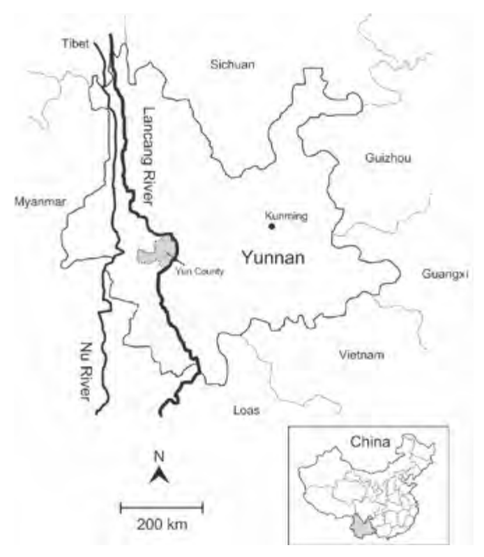
FIGURE 1: MAP OF YUNNAN PROVINCE SHOWING YUN COUNTRY, WHERE THE MANWAN DAM IS LOCATED<sup>33</sup>

China's rivers has made development on the Lancang an attractive option. The first calls to "send western electricity east" by tapping Yunnan's potential were issued in the 1980s, and the policy would go on to be enshrined in China's tenth five-year plan for 2000 to 2005.<sup>36</sup>